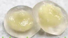
Melon bean paste