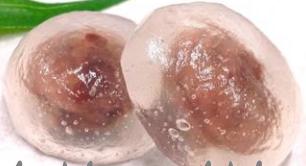
Hokkaido azuki beans