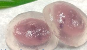
Haskap bean paste