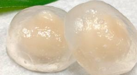
Apple bean paste