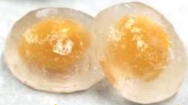
Mango bean paste