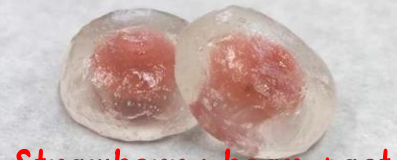
Strawberry bean paste