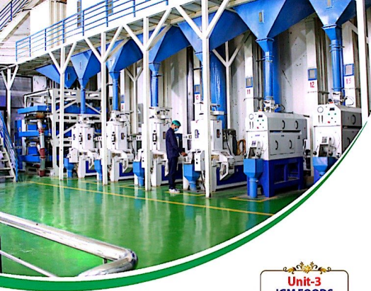
Unit-3 IGM FOODS