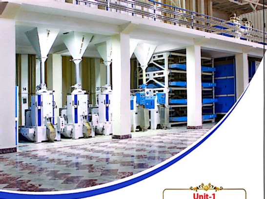
Unit-1 M Raheem Rice Mill