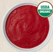
COLD BREAK PASTE WM, LB, SN BIN, DRUM