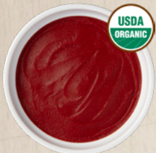
HOT BREAK PASTE WM, LB, SN BIN, DRUM

Items marked with the USDA Organic logo are available in both conventional and organic.