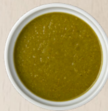
GREEN CHILE PUREE SN DRUM, #10 POUCH