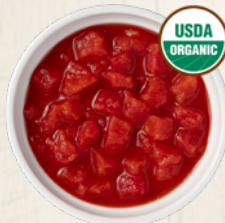
DICED IN JUICE CUT SIZES: 1/2", 3/4", 3/8"x1/2"x3/8" SN BIN, DRUM