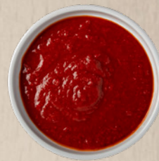
RED CHILE PUREE SN DRUM, #10 POUCH