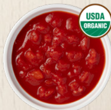
COURSE GROUND IN PUREE SN BIN, DRUM SALT OPTIONAL