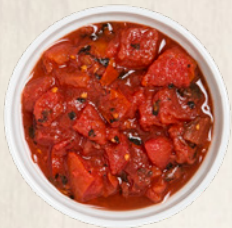
FIRE ROASTED DICED SN BIN, DRUM