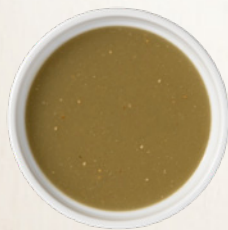
TOMATILLO CRUSHED SN BIN, DRUM