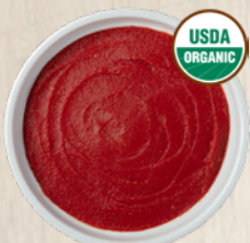
CONCENTRATED CRUSHED WM, LB, SN BIN, DRUM