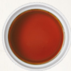
FILTERED TOMATO CONCENTRATE SN *DRUM

*Additional packaging options may be available.