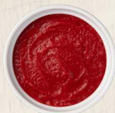
PUREE SN BIN, DRUM