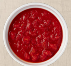
UNPEELED GROUND IN PUREE SN BIN, DRUM SALT OPTIONAL