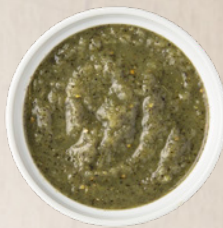
FIRE ROASTED GREEN CRUSHED SN BIN, DRUM