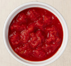
PEELED STRIP CUT IN PUREE SN BIN, DRUM