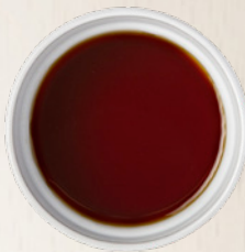
AGED TOMATO CONCENTRATE SN *DRUM