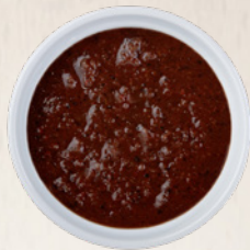
HEAVY FIRE ROASTED CRUSHED SN BIN, DRUM