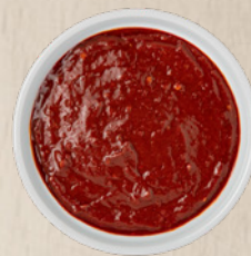
CHIPOTLE PEPPERS IN ADOBO SAUCE SN DRUM, #10 POUCH