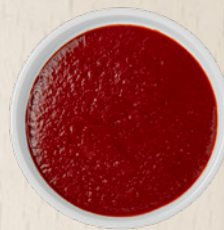
GUAJILLO CHILE PUREE SN DRUM, #10 POUCH