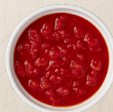
COURSE GROUND IN PUREE EXTRA DRAIN SN BIN, DRUM SALT OPTIONAL