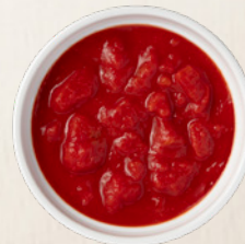
RANDOM KITCHEN CUT IN PUREE SN BIN, DRUM