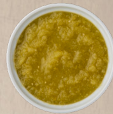
GREEN CRUSHED SN BIN, DRUM