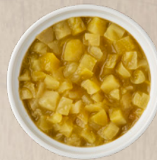
GREEN DICED SN BIN, DRUM