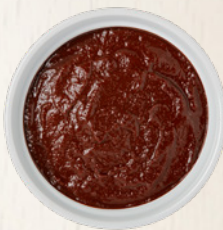
ANCHO PEPPER PUREE SN DRUM, #10 POUCH