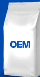
Flat bottom bag