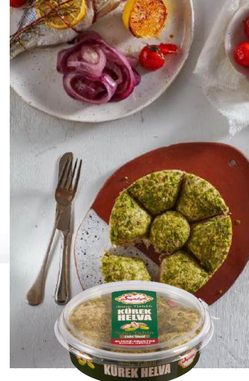
Pistachio Spade Halva