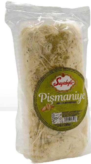
Pişmaniye (Turkish Cotton Candy) Candy Floss