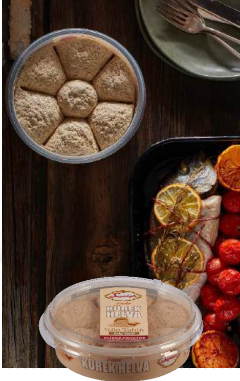
Plain Spade Halva