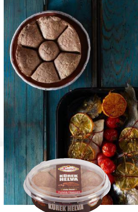
Cocoa Spade Halva