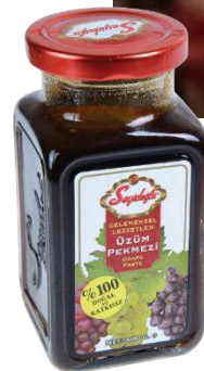
Molasses Varieties Grape - Carob - Mulberry