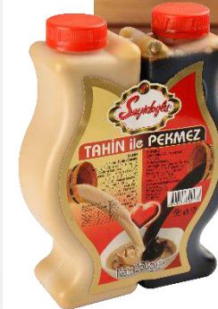
Tahini and molasses