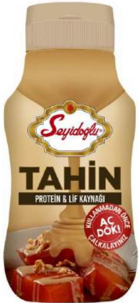
Tahini, Mulberry, Grape, Carob

Seyidoğlu is among the leading brands in the industry with its additional products such as pişmaniye (Turkish cotton candy), Squeezable Products (Tahini, Mulberry, Grape, Carob).