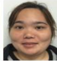
exp support- Cherry