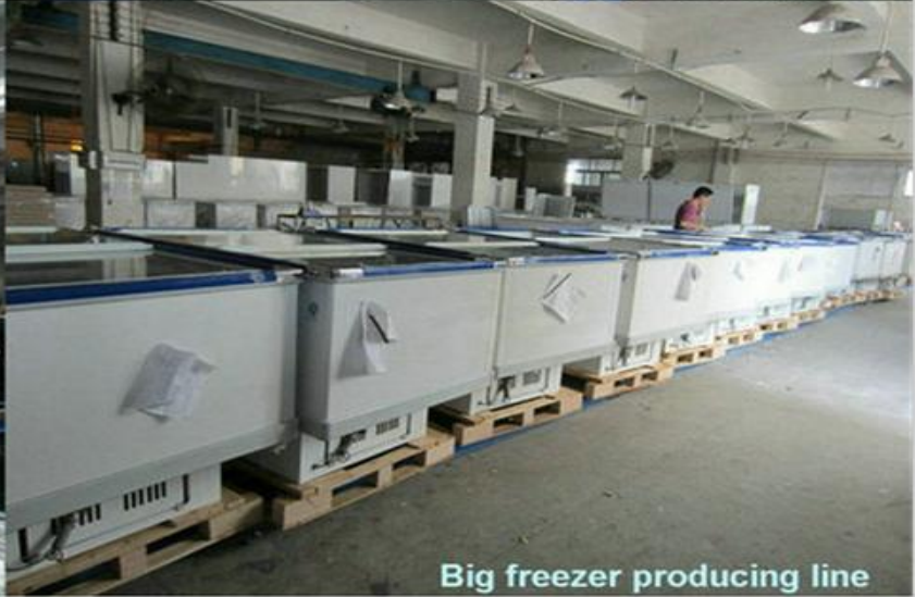
Big freezer producing line