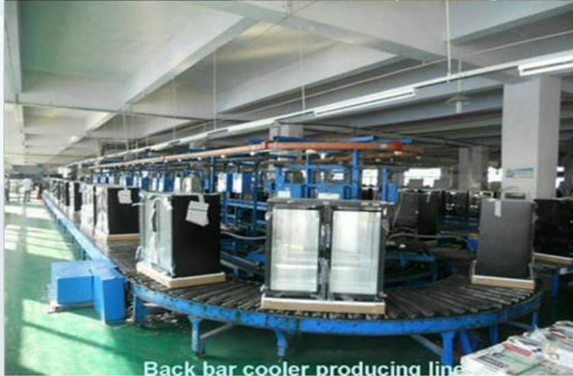
Back bar cooler producing line