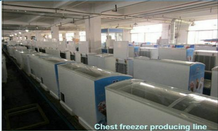
Chest freezer producing line