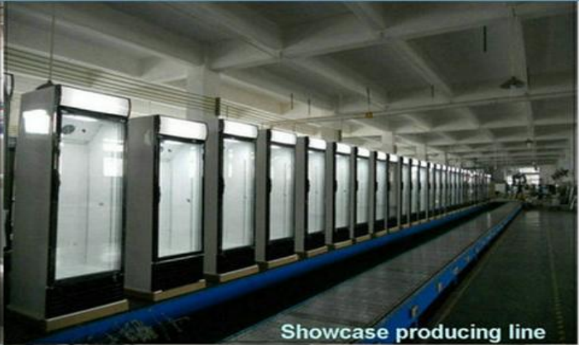
Showcase producing line