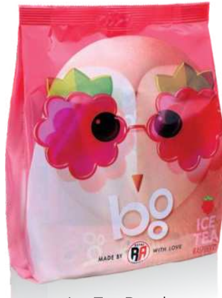
Ice Tea Raspberry 20x20gr(0.7 oz)