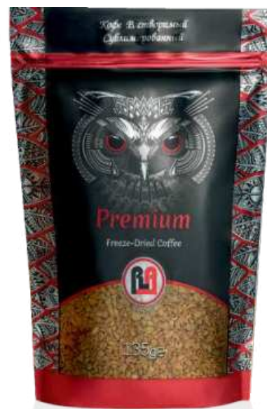
RA Premium 135g (4.76OZ)