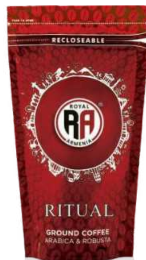
RA Ritual 100g (3.52 oz)