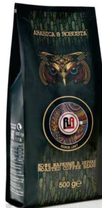
RA Arabica & Robusta 500g (1.1 lb)