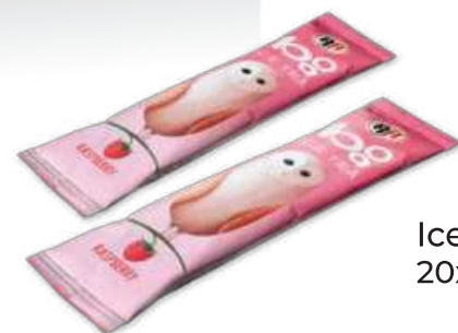
Ice Tea Raspberry 20x20gr(0.7 oz)