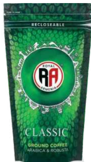
RA Classic 100g (3.52 oz)