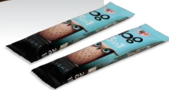
3in1 Light 20x20gr(0.7 oz)