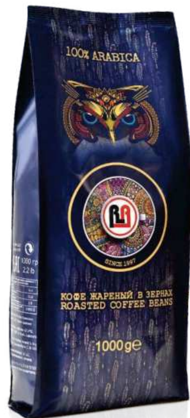
RA 100% Arabica 1000g (2.2 LB)