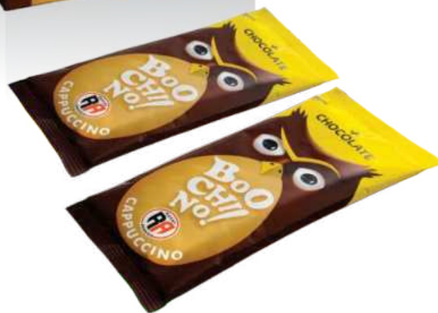
Boochino +Chocolate 20x20gr(0.7 oz)