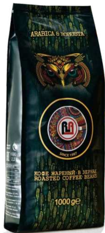
RA Arabica & Robusta 1000g (2.2 LB)