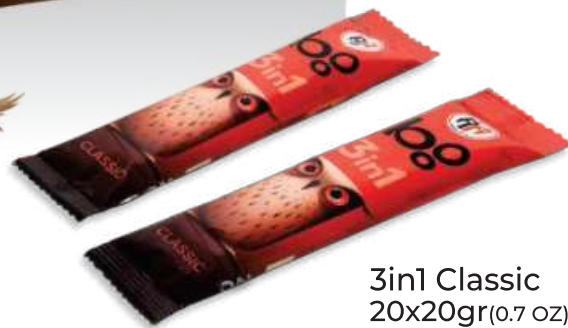
3in1 Classic 20x20gr(0.7 oz)