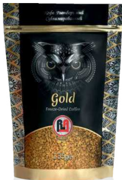
RA Gold 135g (4.76OZ)