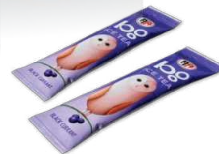
Ice Tea Black Currant 20x20gr(0.7 oz)