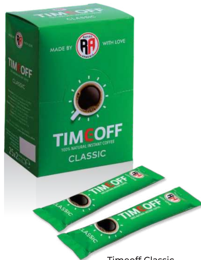
Timeoff Classic 25x2g (0.07 oz)