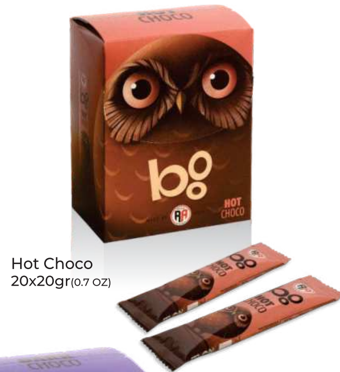
Hot Choco 20x20gr(0.7 oz)