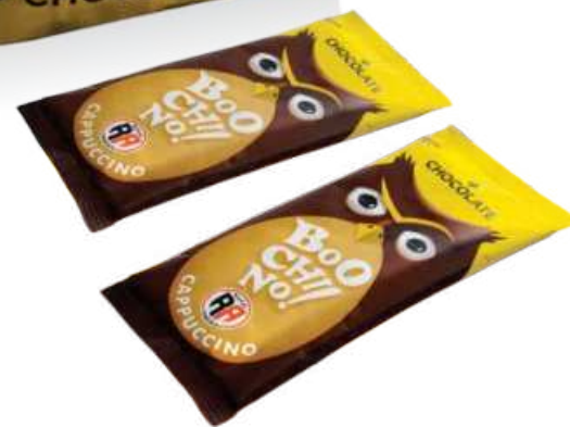
Boochino +Chocolate 20x20gr(0.7 oz)