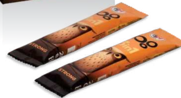
3in1 Strong 20x20gr(0.7 oz)