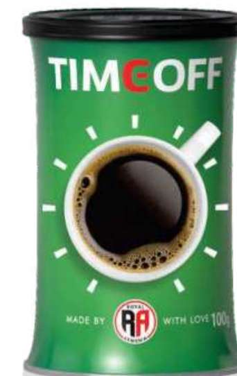
Timeoff Green 100g (3.52 oz)