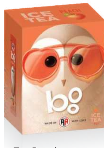
Ice Tea Peach 20x20gr(0.7 oz)