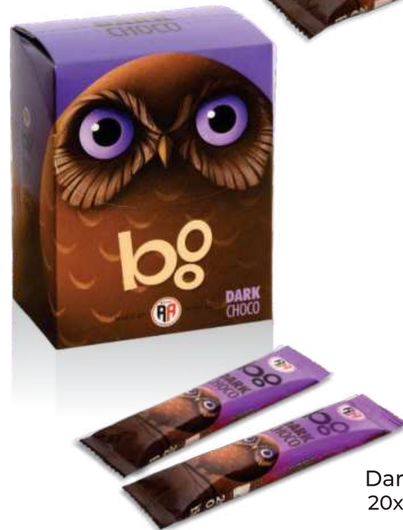
Dark Choco 20x20gr(0.7 oz)