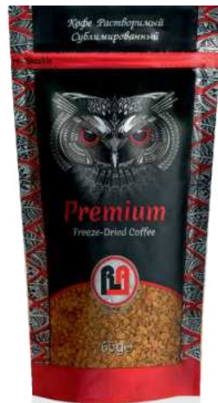
RA Premium 65g (2.29 OZ)