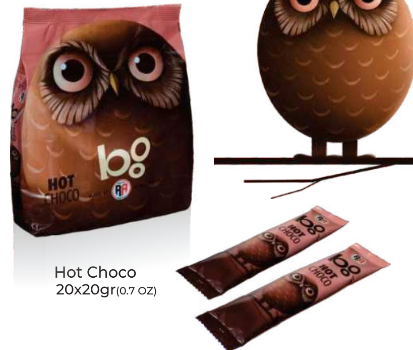
Hot Choco 20x20gr(0.7 oz)