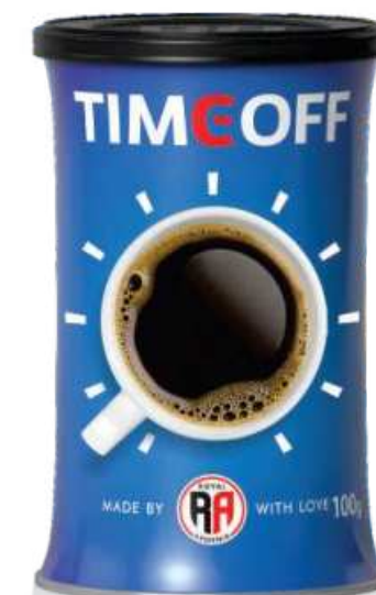
Timeoff Blue 100g (3.52 oz)