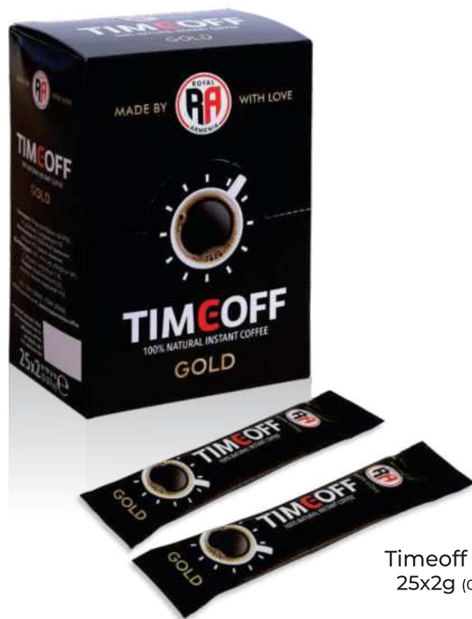
Timeoff Gold 25x2g (0.07 oz)