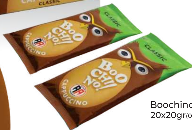
Boochino Classic 20x20gr(0.7 oz)