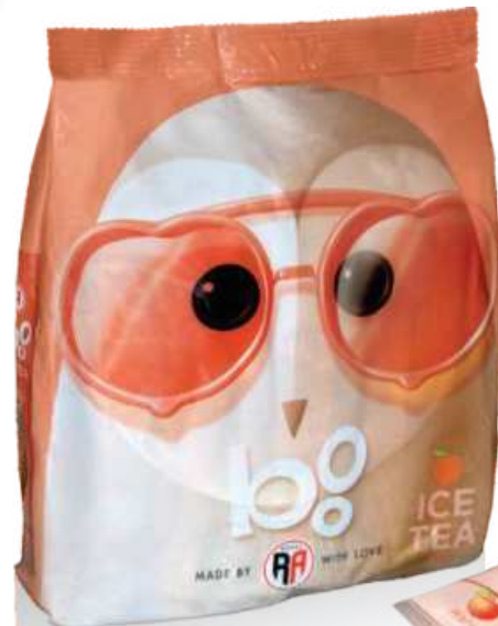
Ice Tea Peach 20x20gr(0.7 oz)