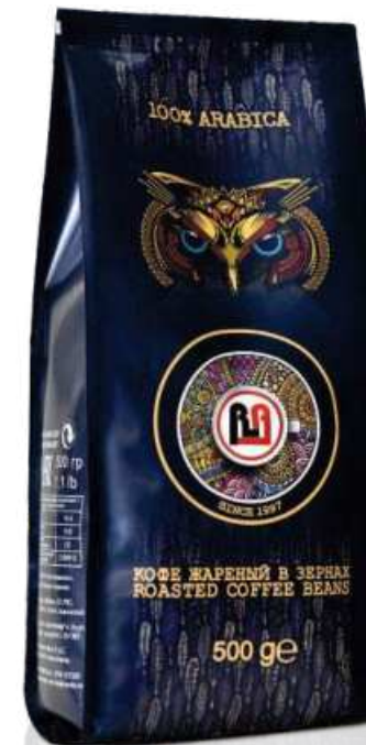
RA 100% Arabica 500g (1.1 lb)