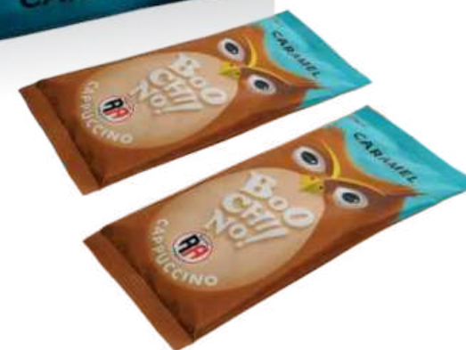
Boochino Caramel 20x20gr(0.7 oz)