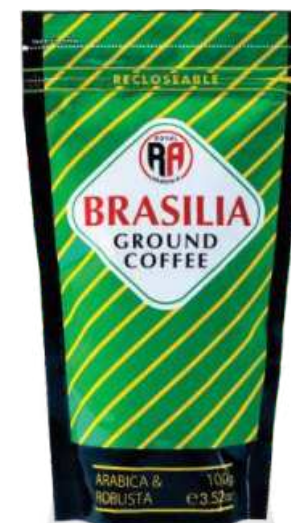
Royal Brasilia Green Coffee 100g (3.52 oz)