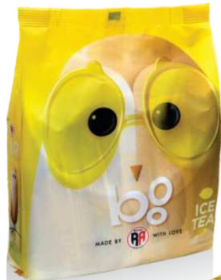
Ice Tea Lemon 20x20gr(0.7 oz)