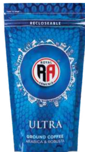
RA Ultra 100g (3.52 oz)