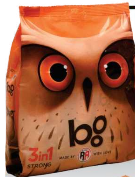
3in1 Strong 20x20gr(0.7 oz)