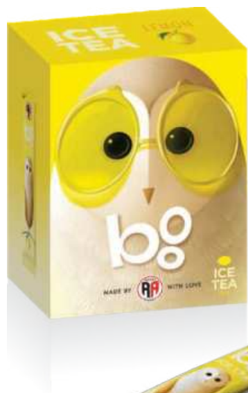
Ice Tea Lemon 20x20gr(0.7 oz)