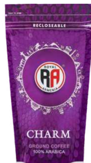
RA Charm 100g (3.52 oz)