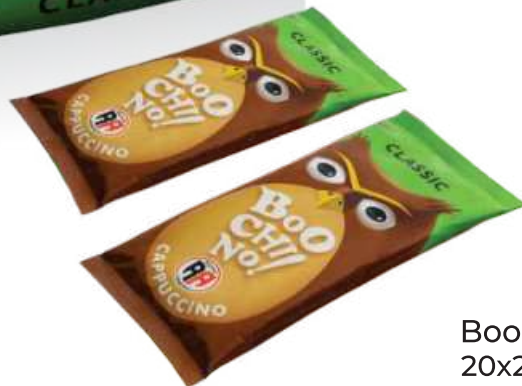
Boochino Classic 20x20gr(0.7 oz)