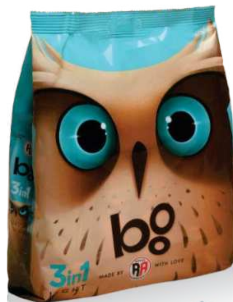
3in1 Light 20x20gr(0.7 oz)