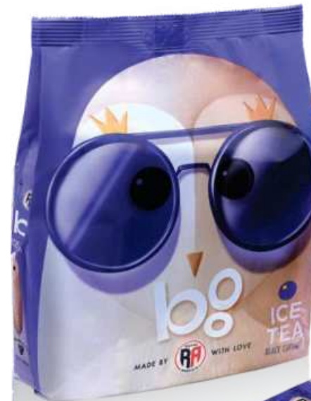
Ice Tea Black Currant 20x20gr(0.7 oz)