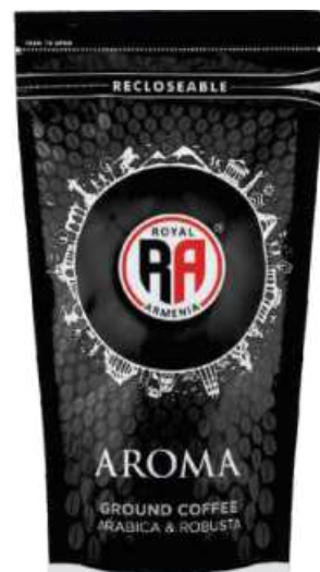
RA Aroma 100g (3.52 oz)