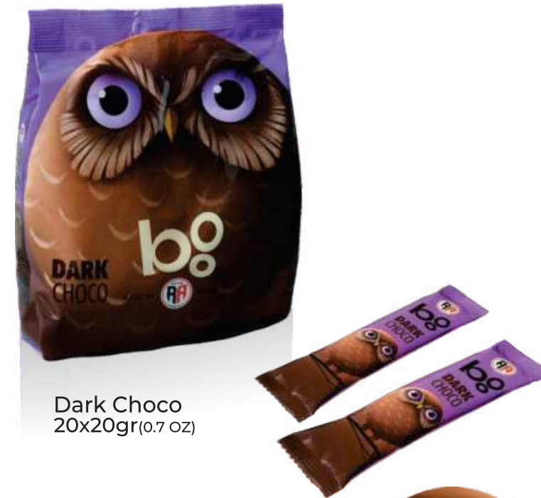
Dark Choco 20x20gr(0.7 oz)