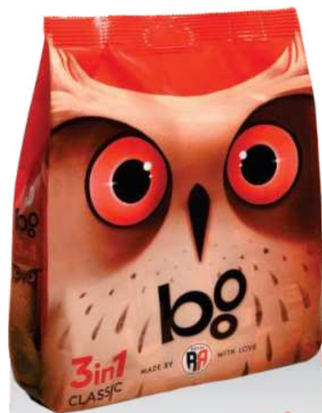
3in1 Classic 20x20gr(0.7 oz)