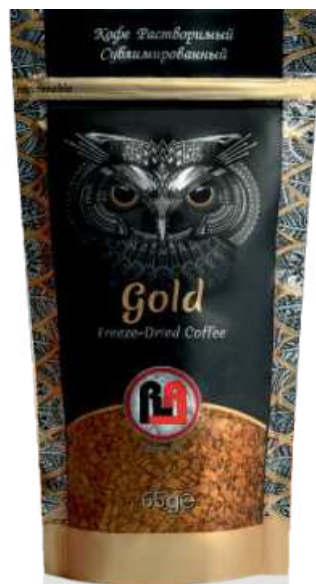
RA Gold 65g (2.29 OZ)