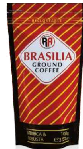
Royal Brasilia Coffee 100g (3.52 oz)