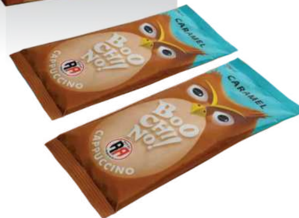
Boochino Caramel 20x20gr(0.7 oz)