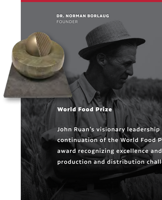
DR. NORMAN BORLAUG FOUNDER

Our teams give back hundreds of hours to the communities in which they live.