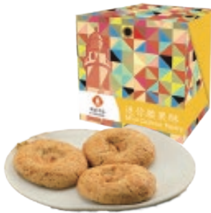
迷你腰果酥 Mini Cashew Pastry