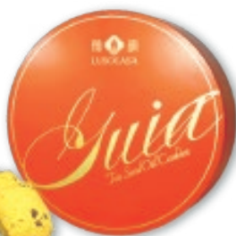
茶籽油曲奇-橙色禮罐 (黑芝麻核桃曲奇/蔓越莓曲奇) Tea Seed Oil Cookies Gift Tin (Black Sesame Walnut Cookies / Cranberry Cookies)