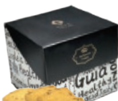
茶籽油曲奇-黑色禮盒 (咖啡朱古力粒茶籽油曲奇) Tea Seed Oil Cookies Gift Box (Coffee With Chocolate Granularity)