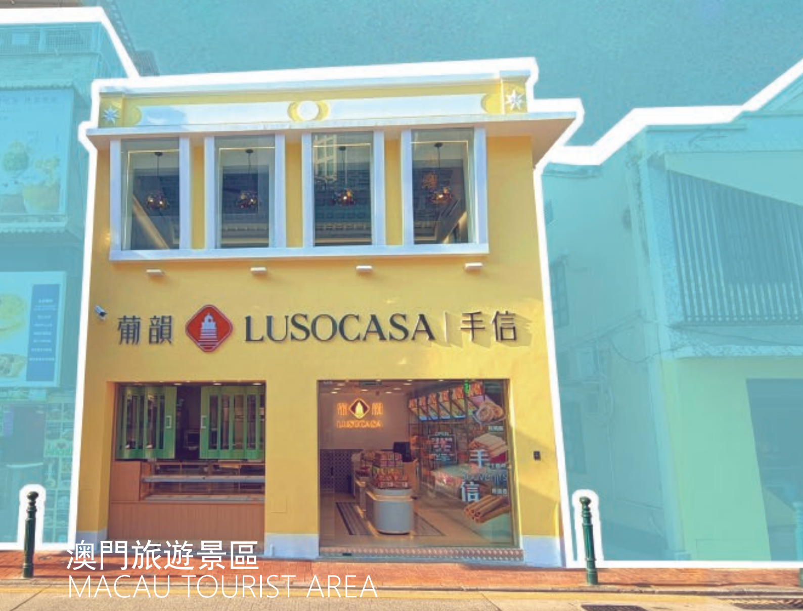
澳門旅遊景區 MACAU TOURIST AREA