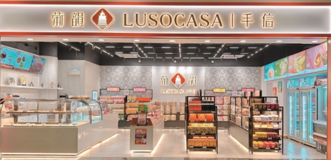
澳門國際機場禁區內 AIRSIDE OF MACAU INTERNATIONAL AIRPORT