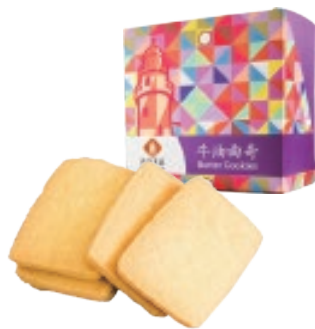
牛油曲奇 Butter Cookies