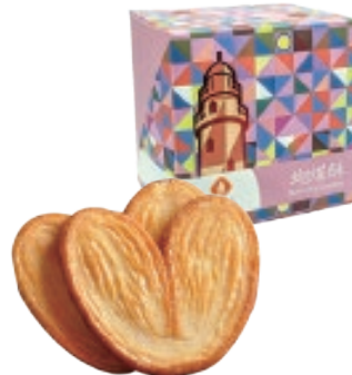
蝴蝶酥 Butterfly Cracker