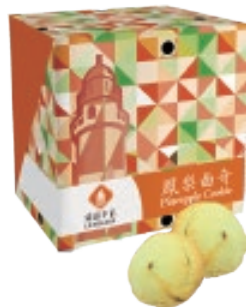
鳳梨曲奇 Pineapple Cookies