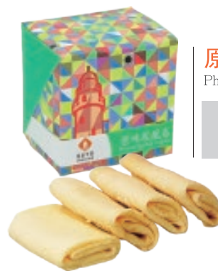
原味鳳凰卷 Phoenix Egg Roll Original