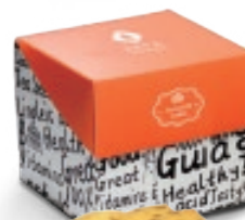
茶籽油曲奇-橙色禮盒 (黑芝麻核桃曲奇/蔓越莓曲奇) Tea Seed Oil Cookies Gift Box (Black Sesame Walnut Cookies / Cranberry Cookies)