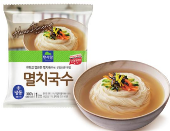
Banquet Noodle in Seafood Soup