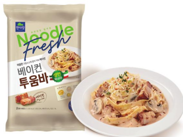
Bacon Toowoomba Pasta

Fettuccine Alfredo with Peperoncino & Bacon