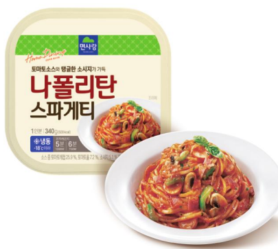
Napolitan Spaghetti with Tomato Sauce and Sausages