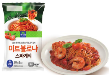
Ragu Bolognese Spaghetti with Meat Sauce