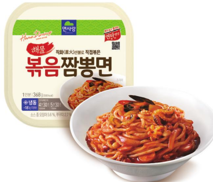
Stir Fry Jjamppong Stir fried in Hot spicy Seafood Vegetable Sauce