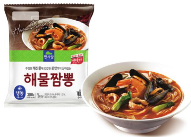
Jjamppong (Hotspicy Seafood Noodle) in Hotspicy Seafood Vegetable Soup