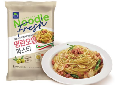
Pollack Roe Oil Pasta

Spaghetti with Tomato Sauce & Cocktail Shrimps