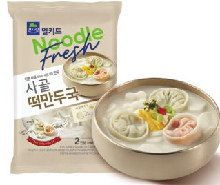
Rice Cake Dumpling Soup in Beef Broth