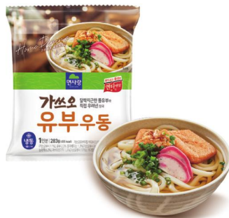
Yubu Udon with Fried Tofu