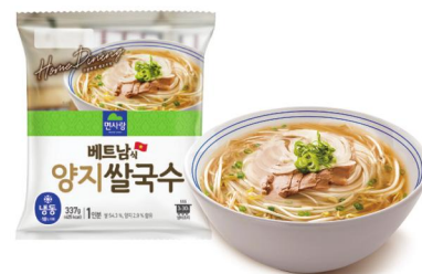
Vietnamese Rice Noodle in Beef Soup