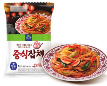
Chinese Japchae Chinese Vermicelli with Stir-fried Meat and Vegetables