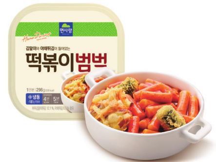
Hotspicy Rice cakes & Fries with fried Vegetables, Seaweed, & Seafood