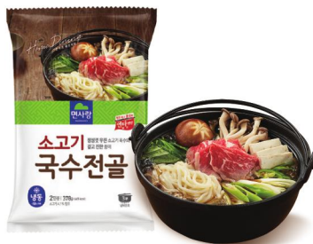
Banquet Noodle in Beef Soup