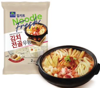
Kimchi Hotpot Udon