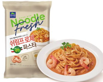
Shrimp Rose Pasta

Fettuccine Alfredo with Peperoncino & Bacon