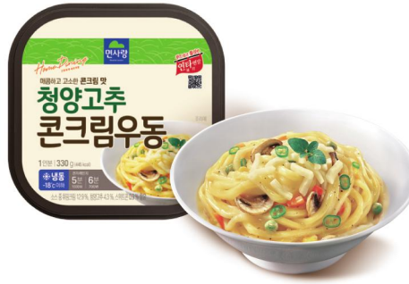
Hotspicy Corn Cream Udon with hot spicy Corn Cream Sauce