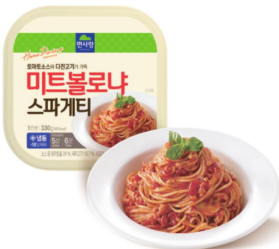
Ragu Bolognese Spaghetti with Meat Sauce