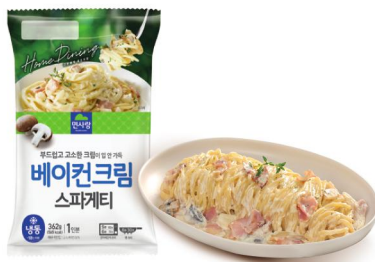
Bacon Cream Spaghetti with Milk Cream & Cheese Sauce