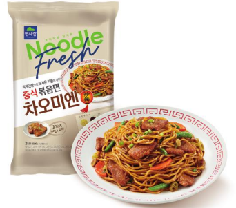
Chinese Chow Mein