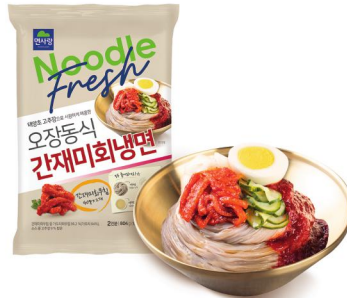
Hotspicy Naeng Mien

Korean Buckwheat Noodles in Chilled Meat Broth