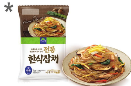
Korean Japchae Korean Vermicelli with Stir-fried Meat and Vegetables