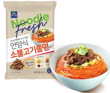
Hotspicy Chewy Noodle

Korean Buckwheat Noodles with Red Pepper Sauce