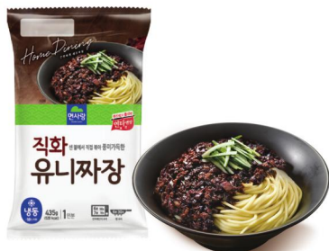
Jjajang (Black Bean Noodle) with Stir-fried Pork and Black bean Sauce