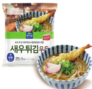
Shrimp Udon with Deep-fried Shrimp