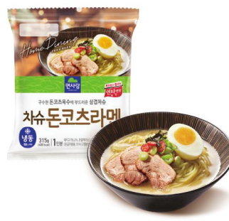
Chashu Ramen in Porkbone Soup with Sliced Pork