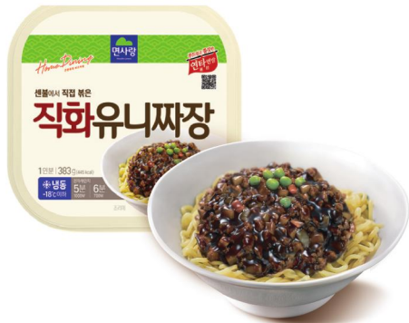
Jjajang (Black Bean Noodle) with Stir-fried Pork and Black bean Sauce