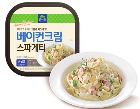
Bacon Cream Spaghetti with Milk Cream & Cheese Sauce