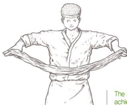
The Pin Pressed (手打): achieving chewiness