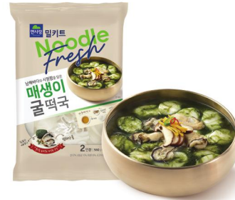
Rice Cake Seafood Soup with Seaweed & Oyster