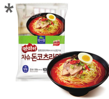
Hotspicy Chashu Ramen in Porkbone Soup with Sliced Pork