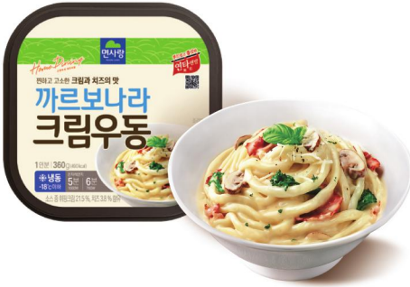
Carbonara Cream Udon with Milk Cream Sauce