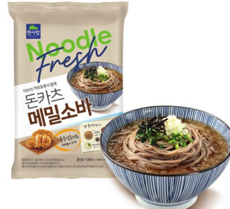
Tonkatsu Buckwheat Soba