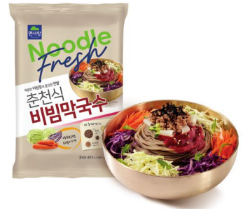
Hotspicy Buckwheat Noodle