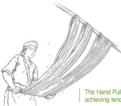
The Hand Pulled (手連) : achieving tenderness