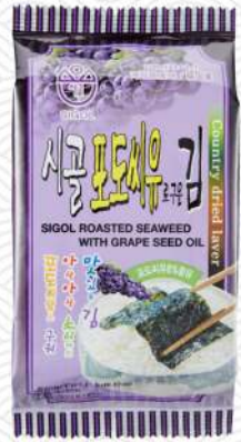
Sigol Roasted Seaweed with Grape seed oil

4g×3packs, 9packs, 10packs, 16packs, 20packs Packing Quantity (1box) : 108packs, 128packs, 192packs