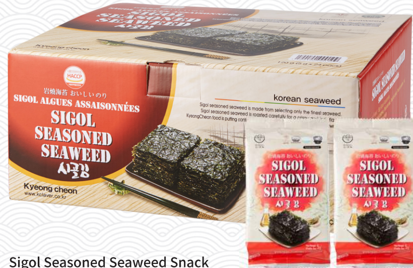
Sigol Seasoned Seaweed Snack