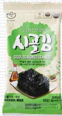
Sigol Seasoned Seaweed (Mini Size)

4g×3packs, 9packs, 10packs, 16packs, 20packs Packing Quantity (1box) : 108packs, 128packs, 192packs