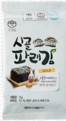
Sigol green Roasted Seaweed (HALAL)

Weight :16g Packing Quantity (1box) : 40packs