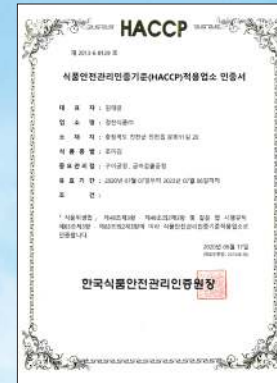
HACCP (Roasted seaweed)