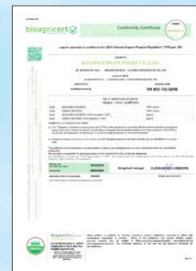
USDA ORGANIC (Organic product)