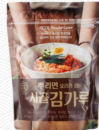
Sigol Premium Shredder Laver

Weight : 70g Packing Quantity (1box) : 20packs