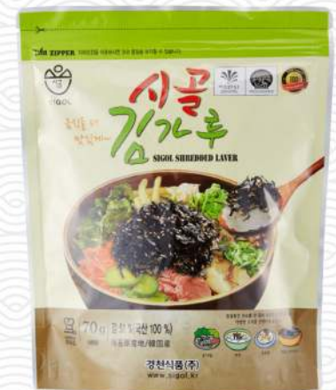
Sigol Shredder Laver

Weight : 40g Packing Quantity (1box) : 20packs