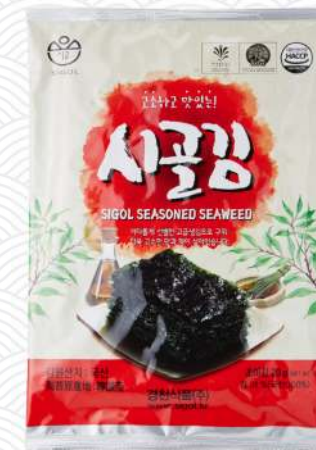
Sigol Seasoned Seaweed

Full size : 20g (10 sheets) Packing Quantity (1box) : 60packs