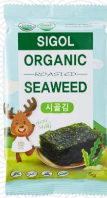
Sigol Organic Seaweed

4g, 4.7g×3packs, 9packs, 10packs, 16packs, 20packs Packing Quantity (1box) : 108packs, 128packs, 192packs