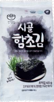
Sigol Seasoned Seaweed Snack (glasswort)

4g, 5g×3packs, 9packs, 10packs, 16packs, 20packs Packing Quantity (1box) : 108packs, 128packs, 192packs