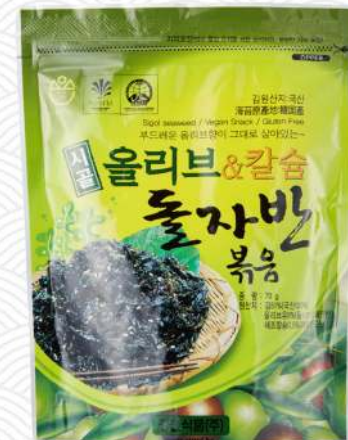
Sigol Laver Snack(Olive & Calcium)

Full size : 60g (12 sheets) Packing Quantity (1box) : 40packs