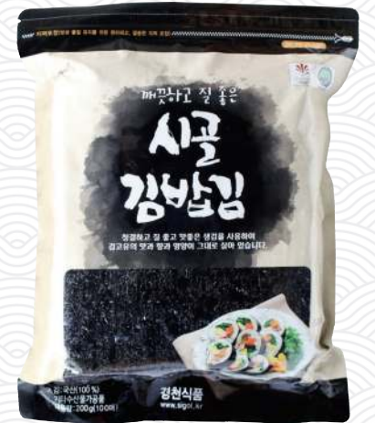
Sigol Roasted Laver(Sushi Laver)

Full size : 200g / 220g / 230g (100 sheets) Packing Quantity (1box) : 40packs