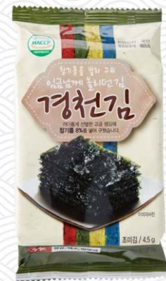
KyeongCheon Roasted Seaweed

4g, 5g×3packs, 9packs, 10packs, 16packs, 20packs Packing Quantity (1box) : 108packs, 128packs, 192packs