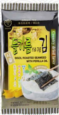
Sigol Roasted Seaweed with Perilla oil

4g×3packs, 9packs, 10packs, 16packs, 20packs Packing Quantity (1box) : 108packs, 128packs, 192packs