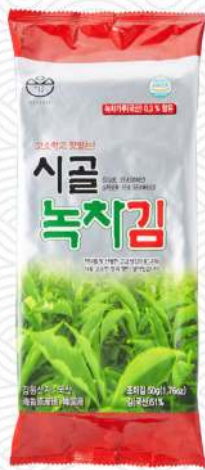
Sigol Green Tea Seaweed (50g)

Packing Quantity (1box) : 20packs, 40packs