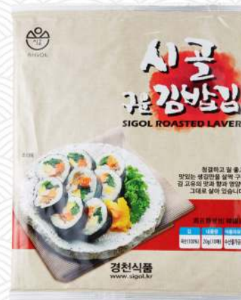
Sigol Roasted Laver(Sushi Laver)

Full size : 200g / 220g / 230g (100 sheets) Packing Quantity (1box) : 40packs