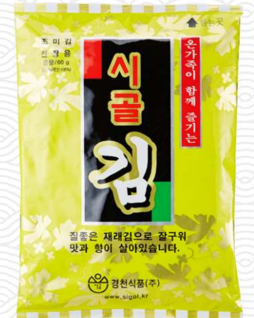
Sigol Seasoned Laver(Gold)

Full size : 20g (5 sheets) Packing Quantity (1box) : 50packs