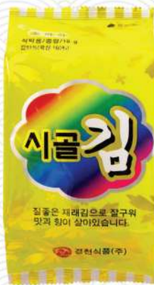
Sigol Premium Roasted Laver

4g×3packs, 9packs, 10packs, 16packs, 20packs Packing Quantity (1box) : 108packs, 128packs, 192packs