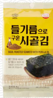
Sigol Roasted Seaweed with Perilla oil

4g×3packs, 9packs, 10packs, 16packs, 20packs Packing Quantity (1box) : 108packs, 128packs, 192packs