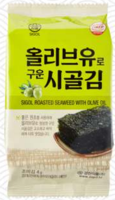
Sigol Roasted Seaweed with Olive oil

4g×3packs, 9packs, 10packs, 16packs, 20packs 14g×20packs, 40packs Packing Quantity (1box) : 108packs, 128packs, 192packs