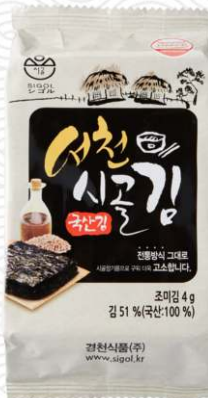
Sigol Seaweed Snack

4.5g×3packs, 9packs, 10packs, 16packs, 20packs Packing Quantity (1box) : 108packs, 128packs, 192packs