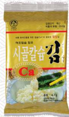
Sigol Calcium Seaweed Snack

4g, 4.7g×3packs, 9packs, 10packs, 16packs, 20packs Packing Quantity (1box) : 108packs, 128packs, 192packs