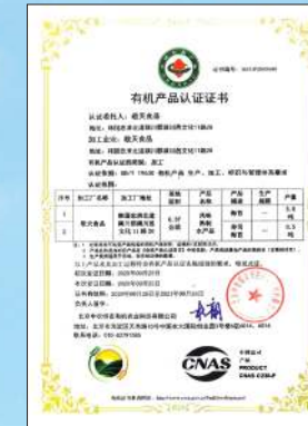
Organic Product (China)