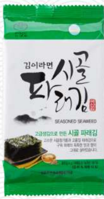
Sigol green Seasoned laver

4g×3packs, 9packs, 10packs, 16packs, 20packs Packing Quantity (1box) : 108packs, 128packs, 192packs