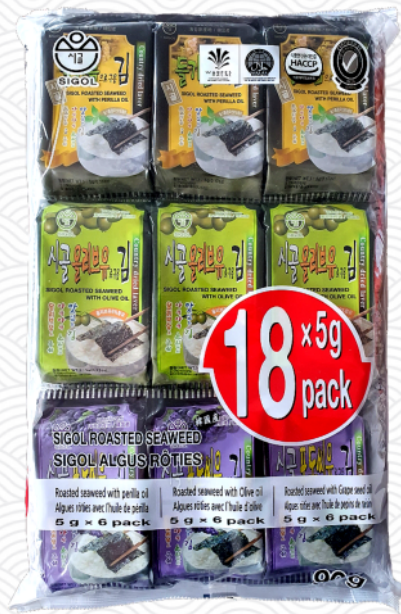
Sigol Seaweed Snack 5gx18