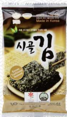
Sigol Seasoned Seaweed (HALAL)

4g×3packs, 6packs, 9packs, 16packs Packing Quantity (1box) : 108packs, 128packs, 192packs