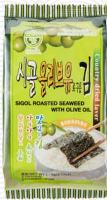
Sigol Roasted Seaweed with Olive oil Snack

5g×3packs, 9packs, 10packs, 16packs, 20packs Packing Quantity (1box) : 108packs, 128packs, 192packs