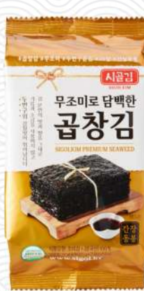
Sigol Premium Roasted Laver (No Salt / No Oil)

Packing Quantity (1box) : 20packs, 40packs