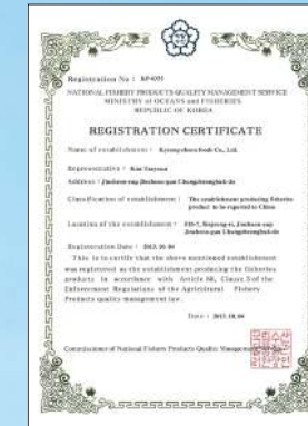
Marine Product (China)