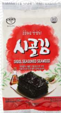
Sigol Seasond Seaweed

4g×3packs, 9packs, 10packs, 16packs, 20packs Packing Quantity (1box) : 108packs, 128packs, 192packs