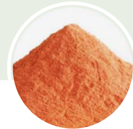
MANGOSTEEN RIND POWDER