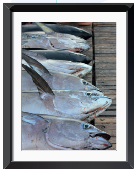
YELLOW FIN TUNA Thunnus albacares