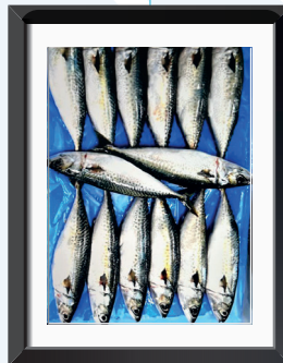
CHUB MACKEREL Scomber japonicus