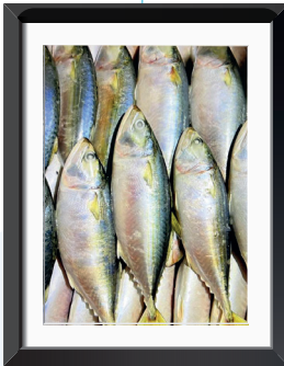
INDIAN MACKEREL Rastrelliger kanagurta