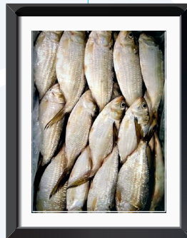
HILSA Nematalosa nasus