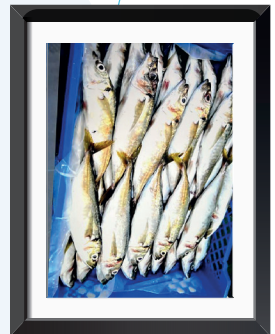
HORSE MACKEREL Decapterus macarellus