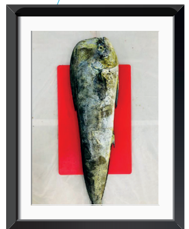
MAHI MAHI Coryphaena hippurus