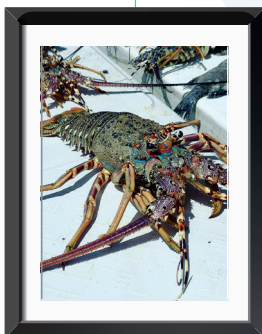
LOBSTER Panulirus spp