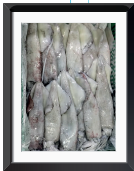
LOLIGO SQUID Loligo spp