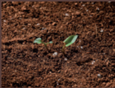
Six months later

Process of Making Eco-friendly Biodegradable Material