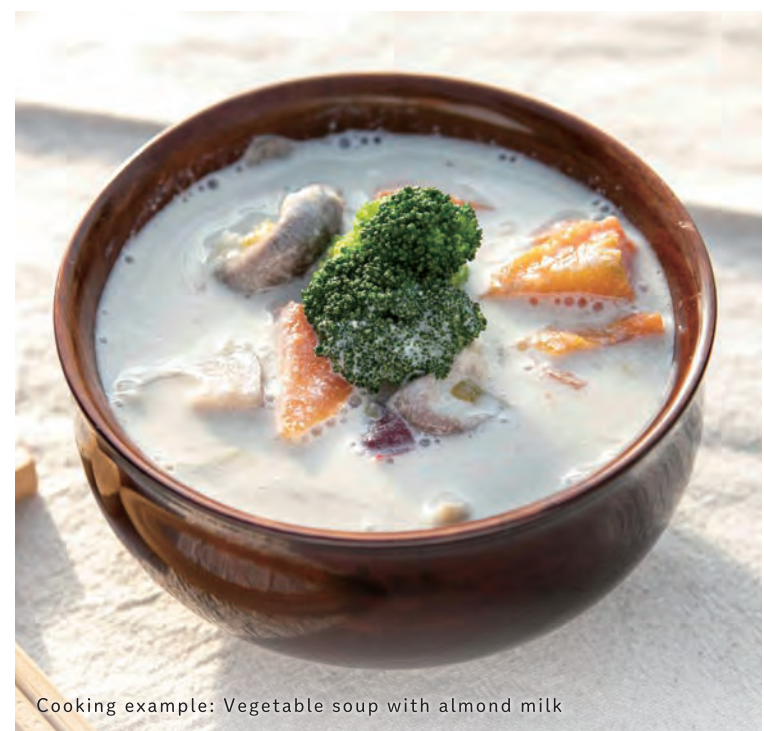
Cooking example: Vegetable soup with almond milk