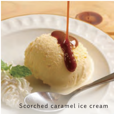
Scorched caramel ice cream