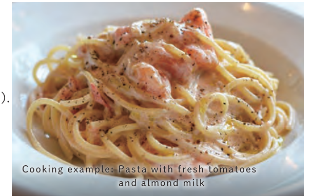
Cooking example: Pasta with fresh tomatoes and almond milk