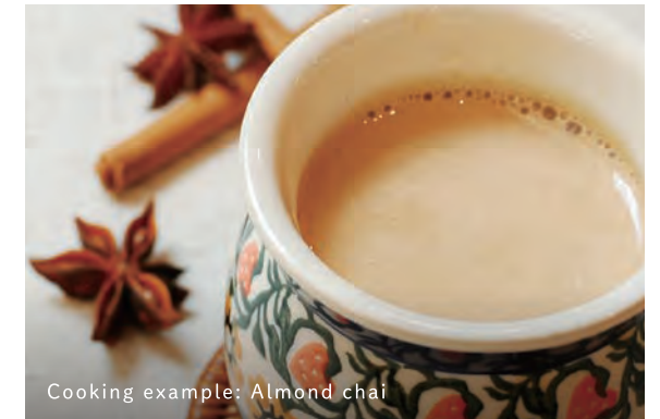
Cooking example: Almond chai