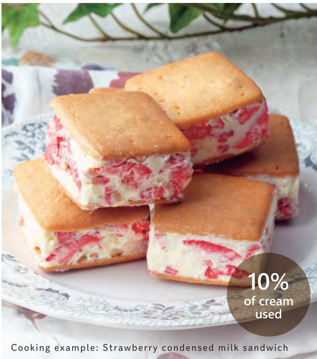
Cooking example: Strawberry condensed milk sandwich

It can be used for various purposes, such as mixing with snack and bread.