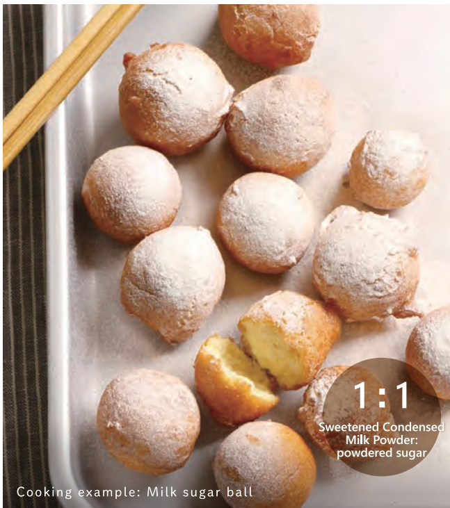
Cooking example: Milk sugar ball