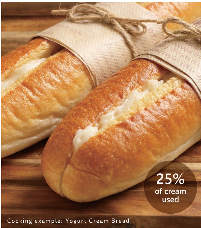
Cooking example: Yogurt Cream Bread