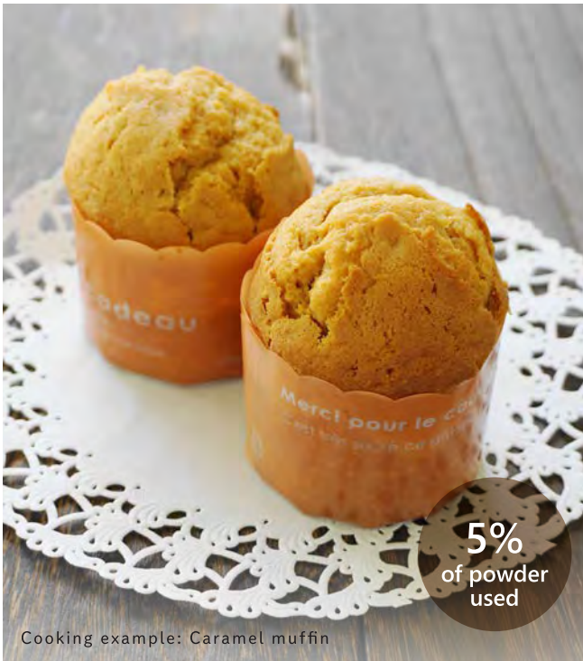
Cooking example: Caramel muffin

The powdered product is used to mix into baked goods and cookies, or to add caramel accents to desserts.