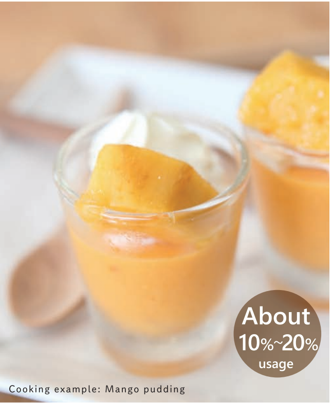
Mango pudding, almond tofu