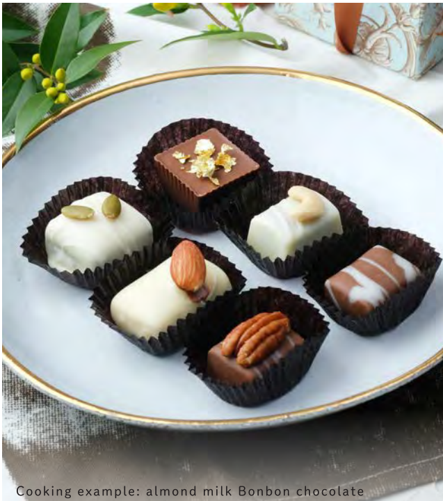
Cooking example: almond milk Bonbon chocolate