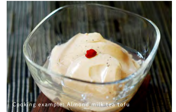
Cooking example: Almond milk tea tofu