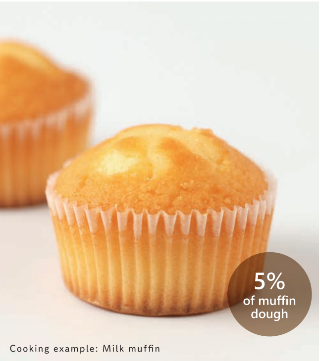
Making confectionery Milk flavored dough and cream