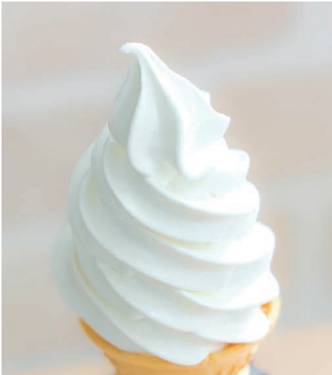
Soft Serve Ice Cream

A classic soft serve ice cream with a rich flavor. This product is economical soft serve ice cream premix powder(vanilla flavor).