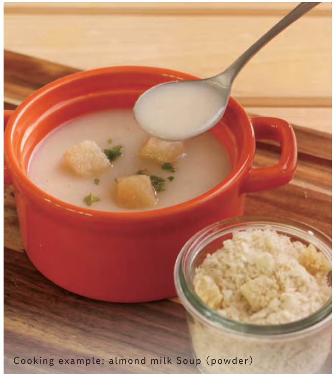
Cooking example: almond milk Soup (powder)