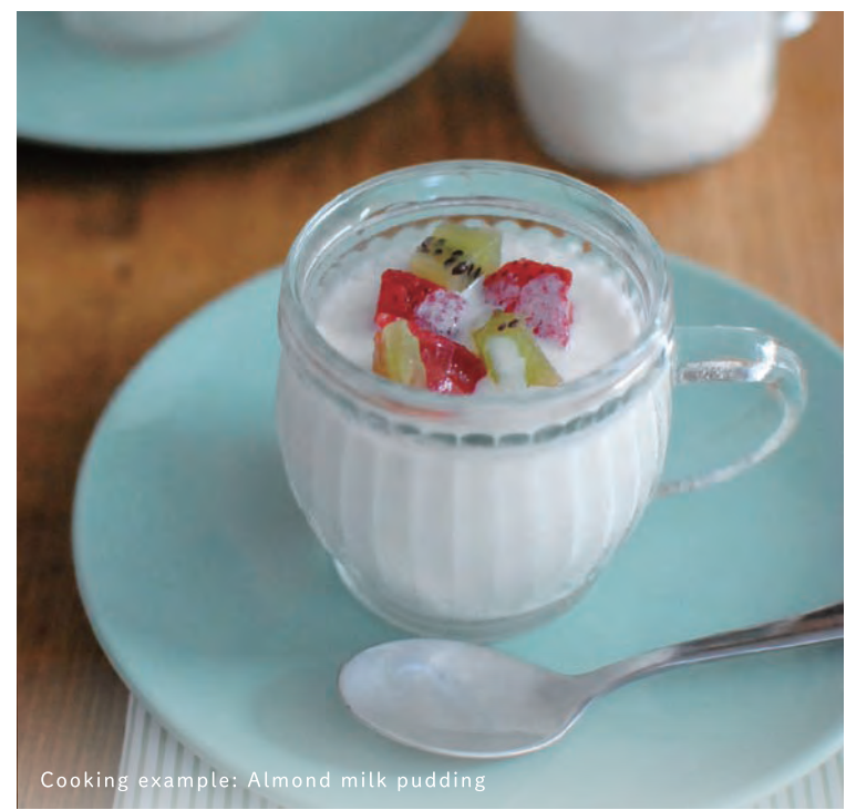
Cooking example: Almond milk pudding