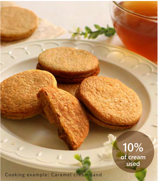
Cooking example: Caramel cream sand