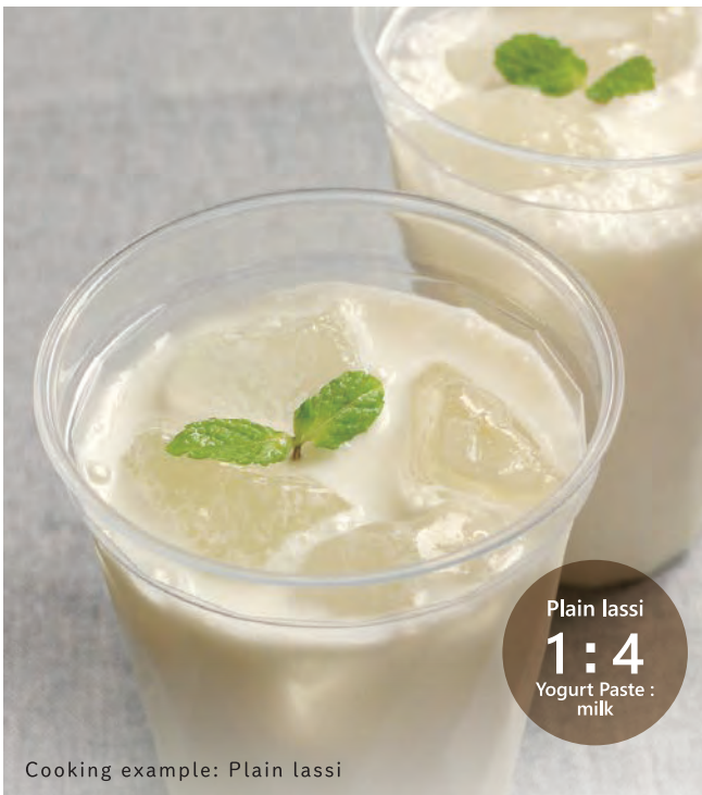
Cooking example: Plain lassi

Making lassi, It can also be used for variety of desserts and ice cream.