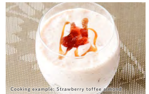
Cooking example: Strawberry toffee almond