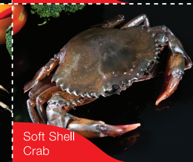
Soft Shell Crab