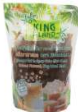
Coconut Gel in Caramel Syrup