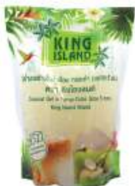
Coconut Gel in Syrup