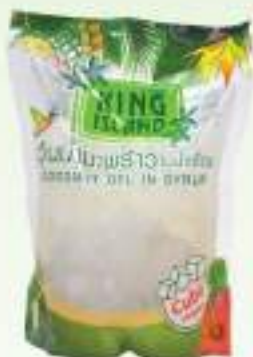
Coconut Gel in Syrup