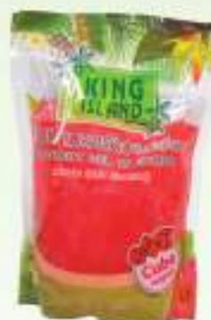
Coconut Gel in Sala Syrup