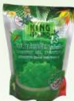
Coconut Gel in Cream Soda Syrup