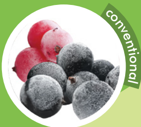
Red and Black Currant