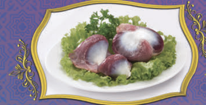
قوانض البط Duck Gizzard 鸭胗