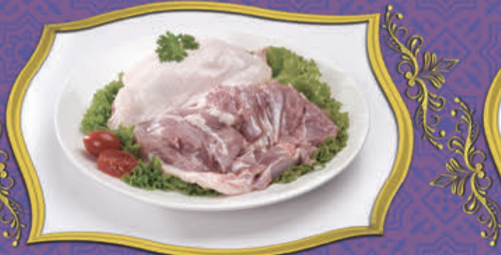
لحم أفخاذ بط (بنون عظم) Duck Leg Meat (Boneless) 鸭腿肉 (去皮)