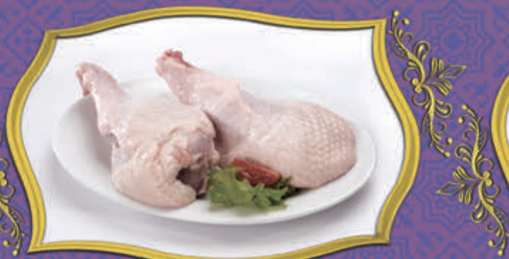
أجنحة بط علوي Duck Drummet 鸭翅腿