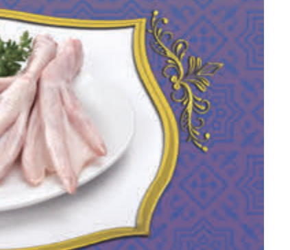
أقدام بط Duck Feet 鸭掌