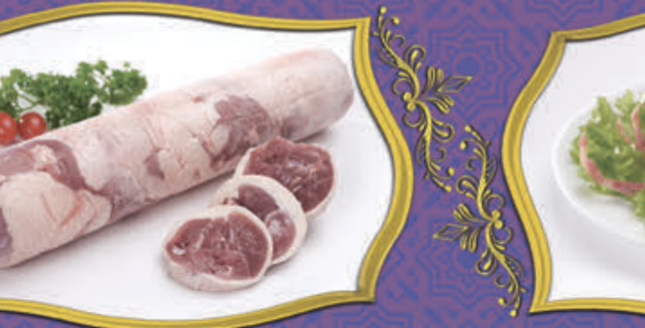
لحم بط Duck Roll 鸭肉卷