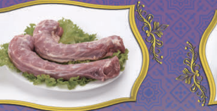
رقاب بط (بنون جلد) Duck Neck (Skinless) 鸭脖子 (去皮)