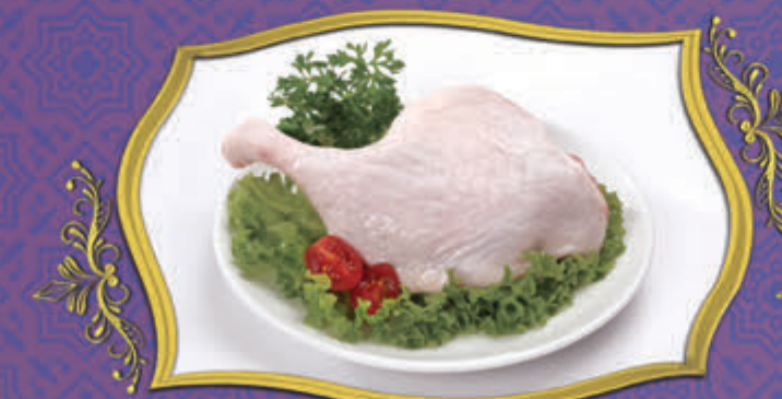
أفخاذ بط Duck Whole Leg 鸭全腿