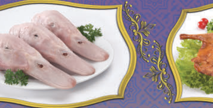
رؤوس بط كاملة مجمدة Duck Whole Head 鸭头