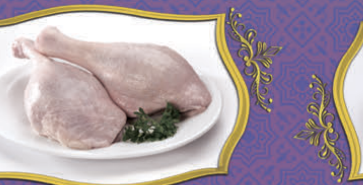
أفخاذ بط سفلي Duck Drumstick 鸭腿