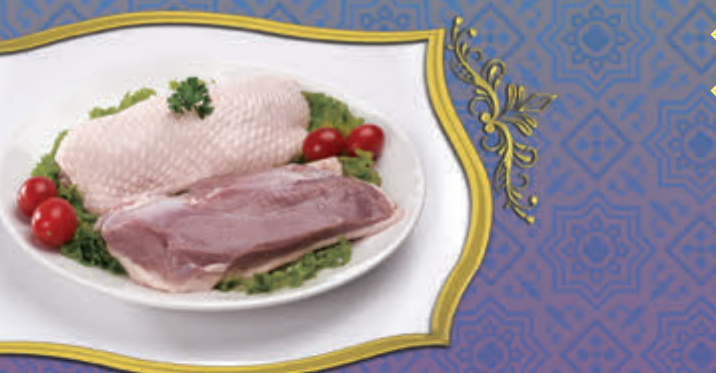
ستيك بط Duck Breast (Steak) Boneless 鸭胸脯肉