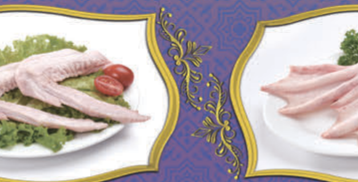
أجنحة بط Duck Wing 鸭翅