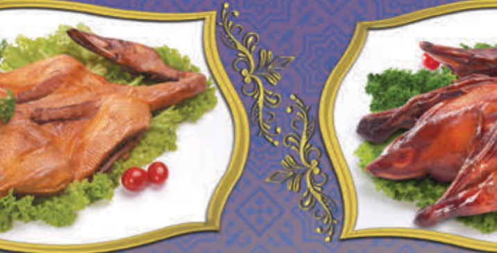
قطيع بط محمرة Duck Pipah Roasted 琵琶烤鸭