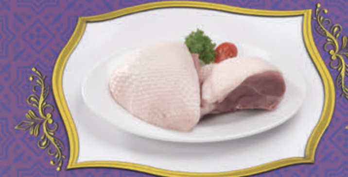
لحم بط (بالعظم) Duck Meat (with Bone) 鸭肉 (带骨)