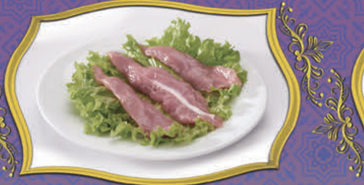
صنوبر بط Duck Sasami 鸭里脊肉