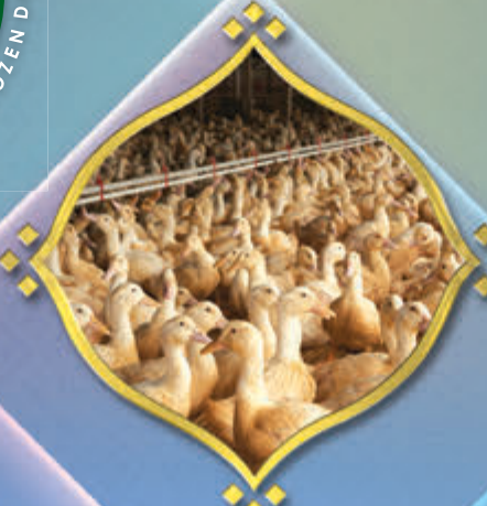
TAIPING, PERAK FACTORY