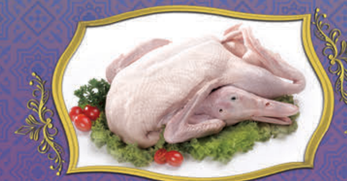
بط كامل مجمد Whole Duck 整鸭