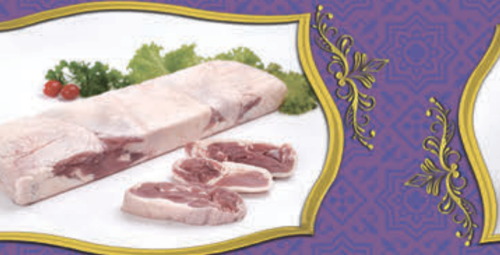
قوالب البط Duck Block 鸭肉块