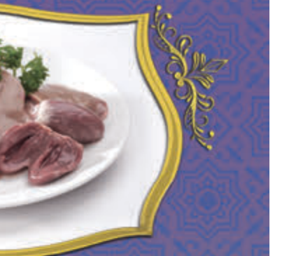
قلوب و كبد البط Duck Heart & Liver 鸭心和鸭肝