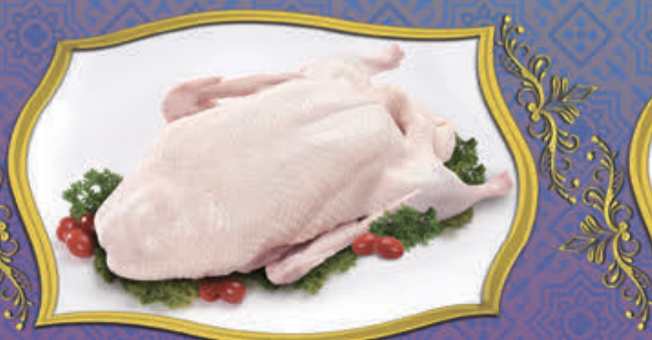
بط كامل مجمد Whole Duck (Without Head & Feet) 整鸭 (去鸭头和鸭掌)