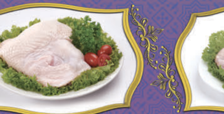
لحم بط من الخاصة Duck Loín 鸭胸肉