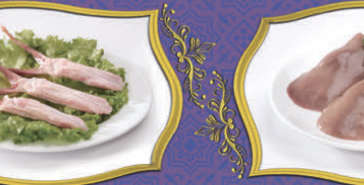
ألسنة بط Duck Tongue 鸭舌