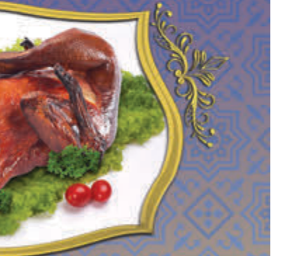
قطيع بط محمرة Duck Round Roasted 烤全鸭

One of the world's top duck processing factory, Perak Duck Food Industries Sdn Bhd has been working closely with CF Company in Japan to produce delicious and healthy duck, quality guaranteed. According to the information provided by the Frozen Food Association, an R&D team from Japan discovered that there are abundant nutrients in duck, e.g. fatty acids, Vitamin A, B2 and minerals. Another study reveals that eating duck can help lower lipid level in the body and improve blood circulation, ample proof of the fact that duck is one of the most nutritious meat.