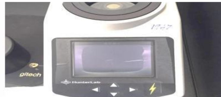
HUNTERLAB COLOR METER