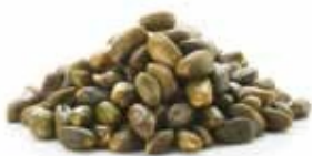
Whole Green Kernels