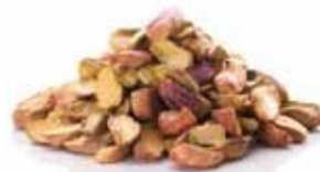
Halves &amp; Pieces