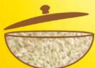
IR 64 WHITE RICE