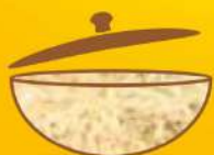
PR - 106