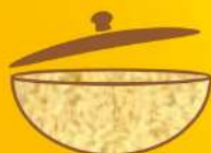
IR 64 SELLA RICE

We are also exporting different varieties of non basmati rice to different parts of the world in various packing sizes and in bulk quantities.