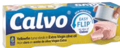
Extra Virgin Olive oil