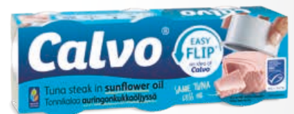
Sunflower oil MSC