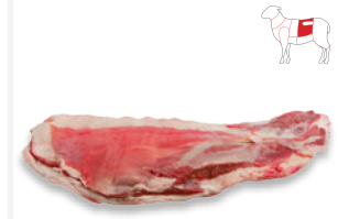
BONE IN FLANK