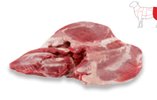
BONELESS LEG CHUMP OFF, SHANK OFF TUNNEL BONED