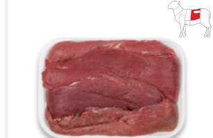
BONELESS LOIN PAD