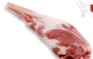
BONE IN LEG CHUMP OFF CKT