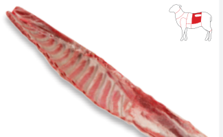
BONE IN LOIN