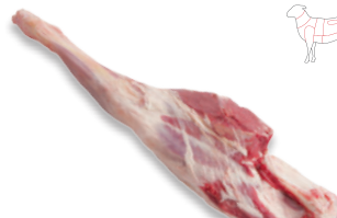
BONE IN LEG