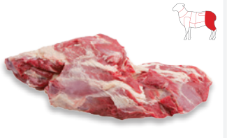
BONELESS LEG SHANK OFF SLASH TUNNEL BONED