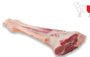
BONE IN SHANK