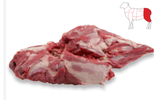
BONELESS LEG SHANK OFF SLASH BONED