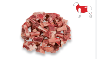
BONE IN CUBES