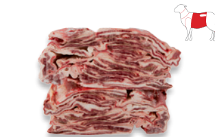
MUTTON FAT FLANK 60/40 VL