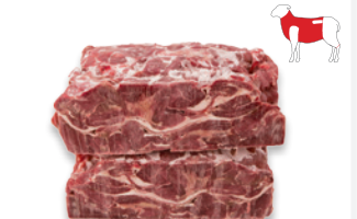
MUTTON TRUNK 90/10VL