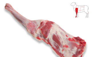
BONE IN SHOULDER