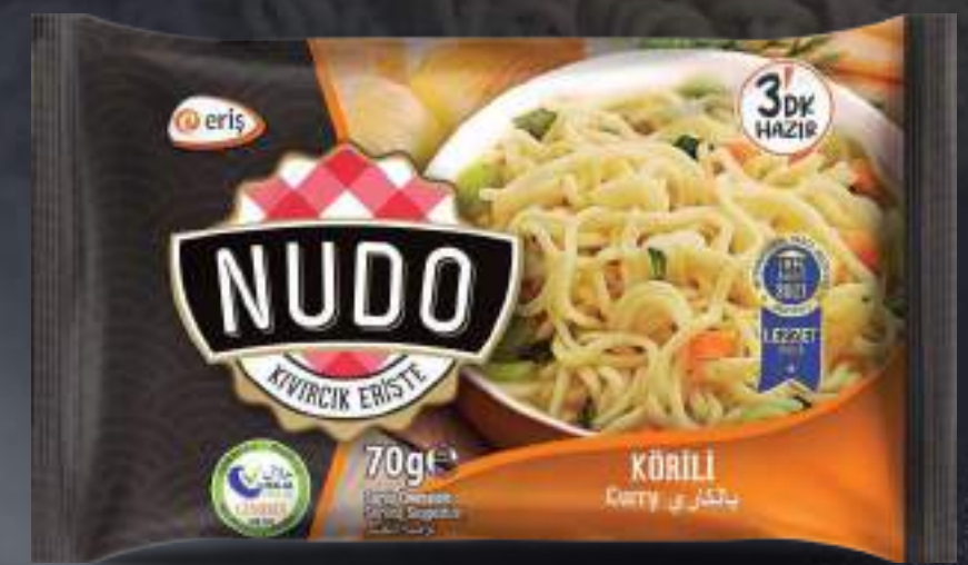
Noodles With Curry