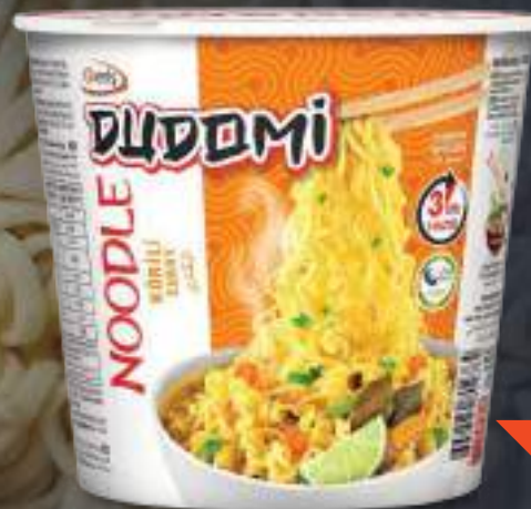
Noodles With Curry