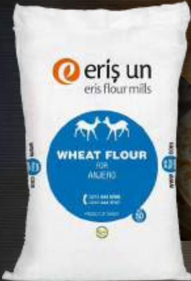
Wheat Flour For Anjero