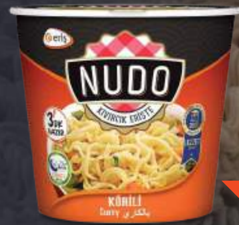
Noodles With Curry