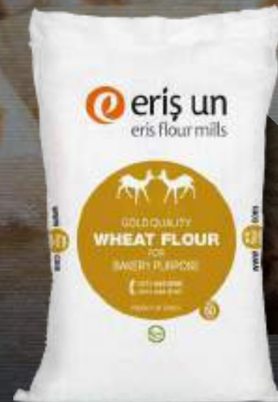
Gold Quality Wheat Flour For Bakery Purpose