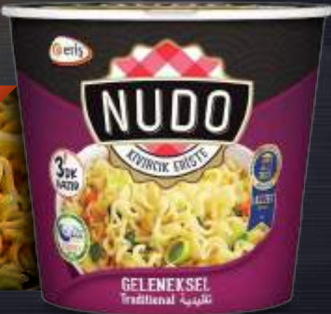
Noodles With Traditional Seasoning