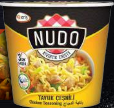
Noodles With Chicken Seasoning