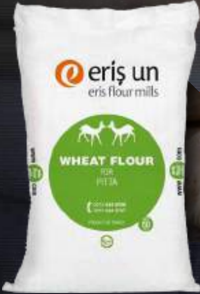
Wheat Flour For Pitta