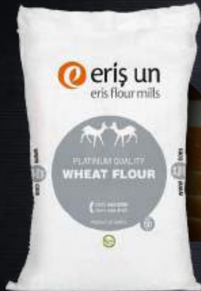
Platinum Quality Wheat Flour