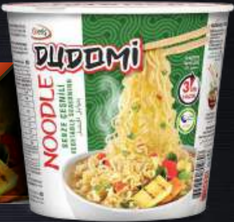
Noodles With Vegetables Seasoning