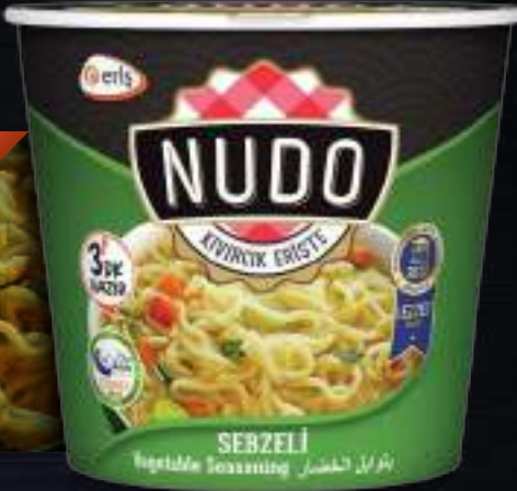
Noodles With Vegetables