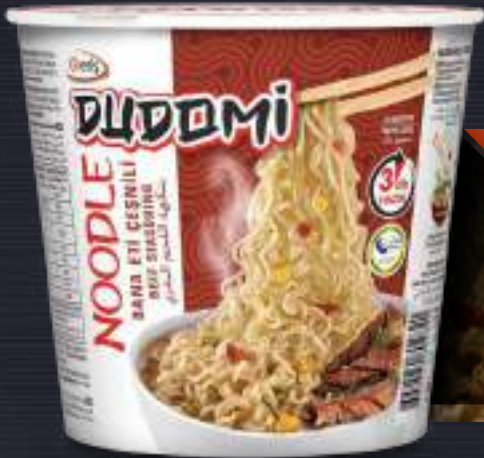
Noodles With Beef Seasoning