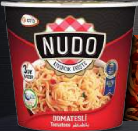
Noodles With Tomatoes