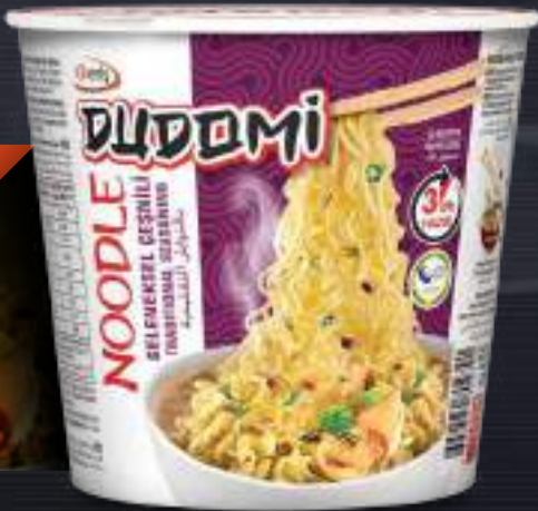
Noodles With Traditional Seasoning