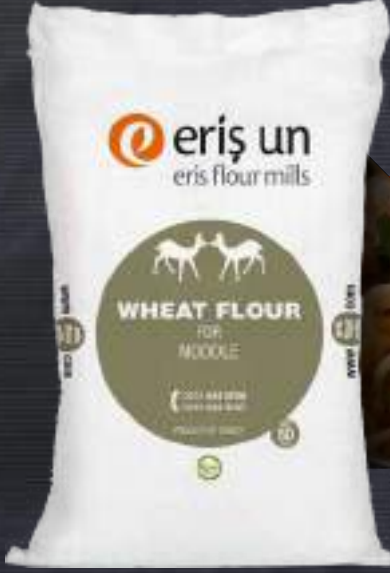
Wheat Flour For Noodle