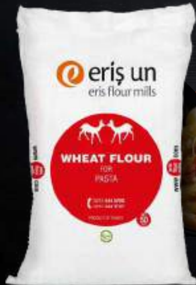
Wheat Flour For Pasta