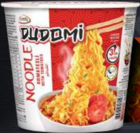
Noodles With Tomatoes