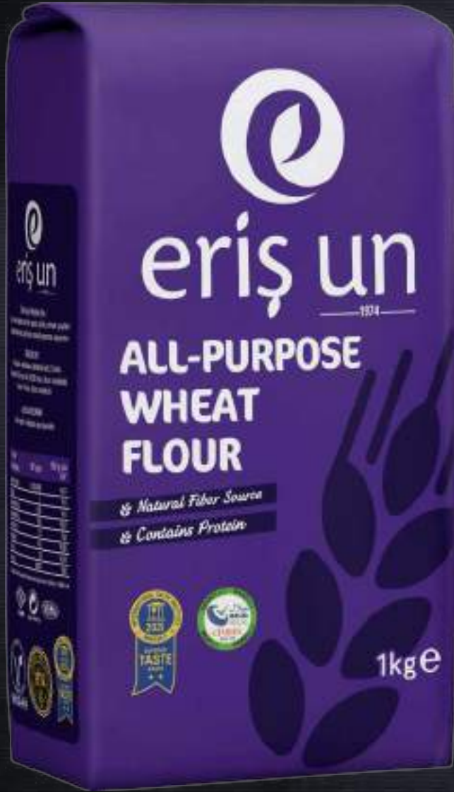
All-Purpose Wheat Flour