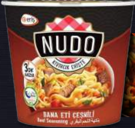
Noodles With Beef Seasoning