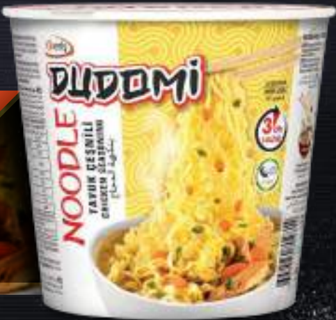
Noodles With Chicken Seasoning