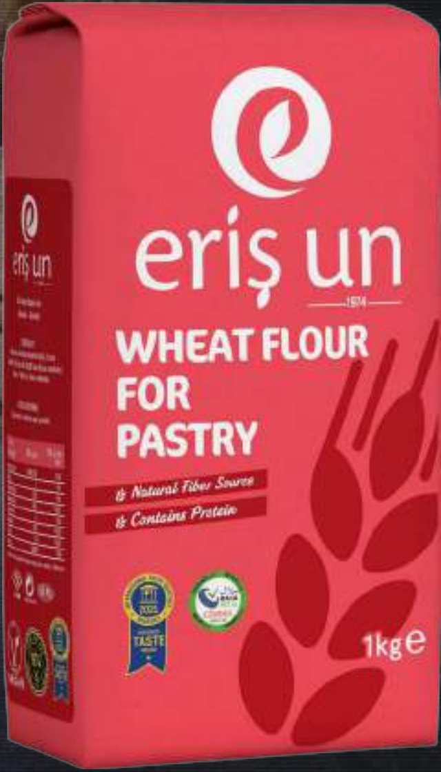
Wheat Flour For Pastry