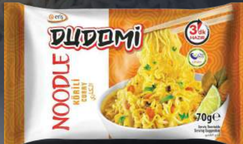
Noodles With Curry