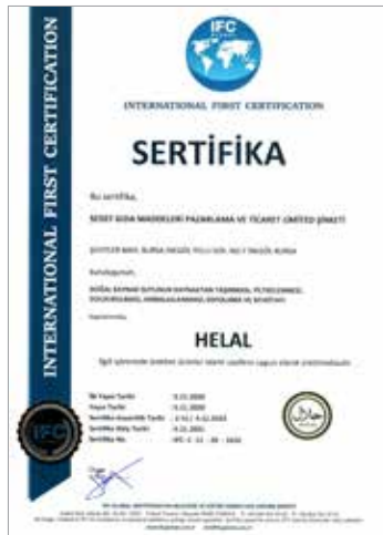
Halal Food Certificate