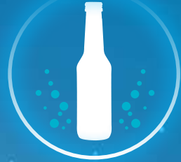
SULTAN WATER REFRESHING SHERBET