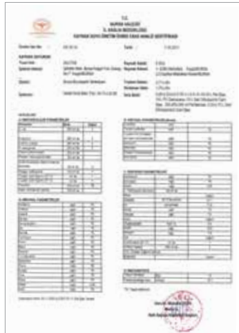
Natural Spring Water Certificate of Analysis