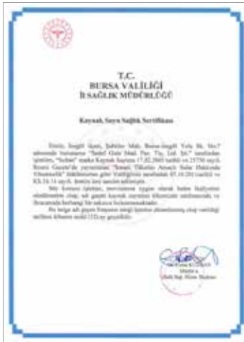
Natural Spring Water Production Permit Licence