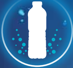
SULTAN NATURAL SPRING WATER GROUP