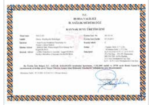
Sultan Natural Spring Water Group Health Certificate 2020