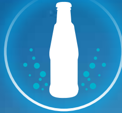
SULTAN NATURAL RICH MINERAL BEVERAGE GROUP