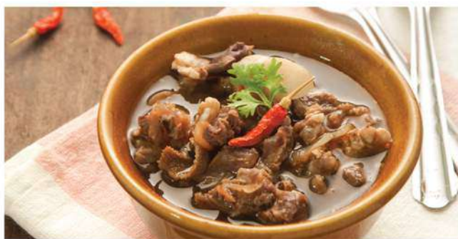
SPICY ASIAN BEEF STEW