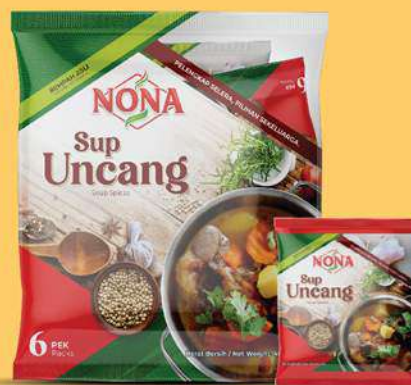
Economy Pack 8g x 6 x 50