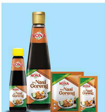
Sos Nasi Goreng Fried Rice Sauce