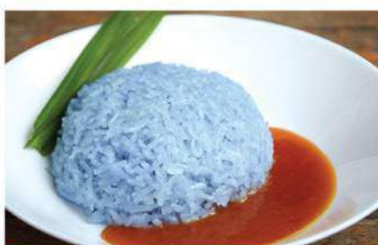
NYONYA GLUTINOUS RICE WITH COCONUT JAM