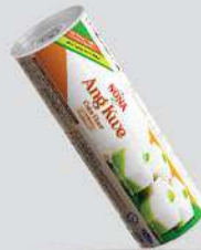
Tepung Pelita Ang Kwe Putih White Ang Kwe Cake Flour