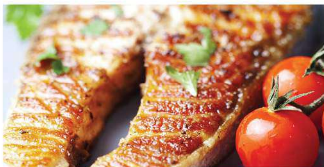
SESAME PAN-SEARED SALMON