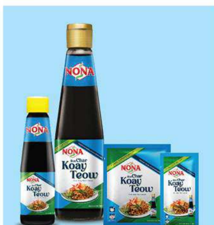
Sos Char Koay Teow Fried Koay Teow Sauce