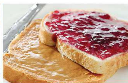
PEANUT BUTTER JAM ON TOAST