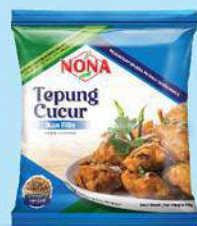
Tepung Cucur Ikan Bilis Anchovy Fritter Flour