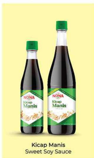
Kicap Manis Sweet Soy Sauce