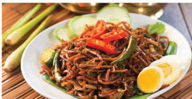
MAMAK STYLE FRIED NOODLE