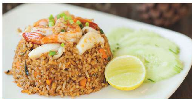
SEAFOOD FRIED RICE