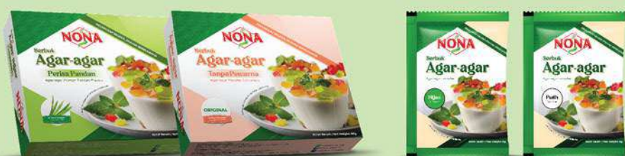
Serbuk Agar-agar Agar-agar Powder