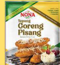
Tepung Goreng Pisang Banana Fritter Flour