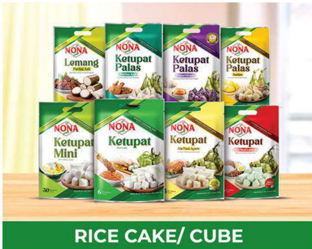
RICE CAKE/ CUBE