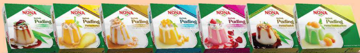
Serbuk Puding Pudding Powder