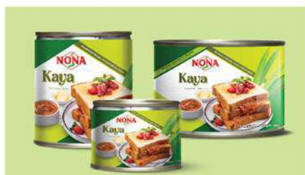
Kaya Coconut Spread