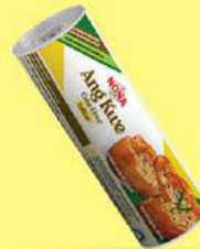
Tepung Pelita Ang Kwe Kuning Yellow Ang Kwe Cake Flour