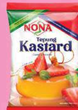
Tepung Kastard Custard Powder