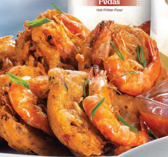
Traditional Prawn Fritter