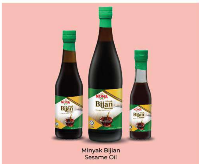
Minyak Bijan Sesame Oil