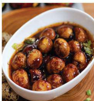
QUAIL EGGS SAMBAL