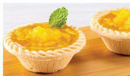
PINEAPPLE JAM TART