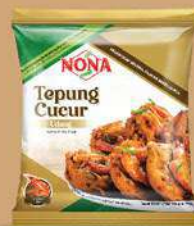
Tepung Cucur Udang Prawn Fritter Flour