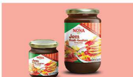
Jam Buah-buahan Mix Fruits Jam