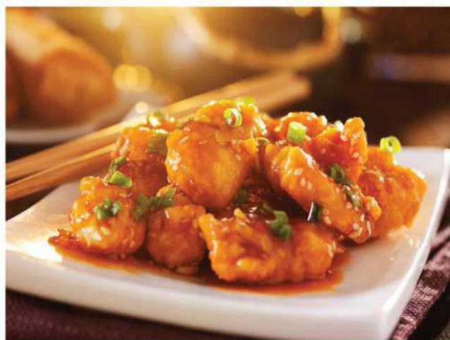
CRISPY SESAME CHICKEN