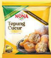
Tepung Cucur Durian Durian Fritter Flour