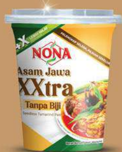
Asam Jawa Seedless Tamarind Paste