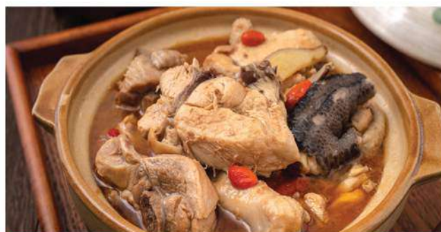
TAIWANESE SESAME OIL CHICKEN SOUP