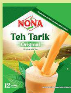
Teh Tarik Instant Milk Tea