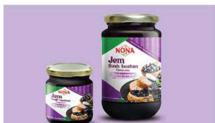
Jam Blackcurrant Blackcurrant Jam