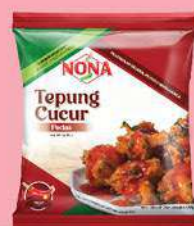
Tepung Cucur Pedas Spicy Fritter Flour