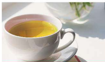
HONEY GINGER TEA