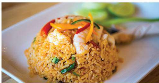
TOM YAM FRIED RICE