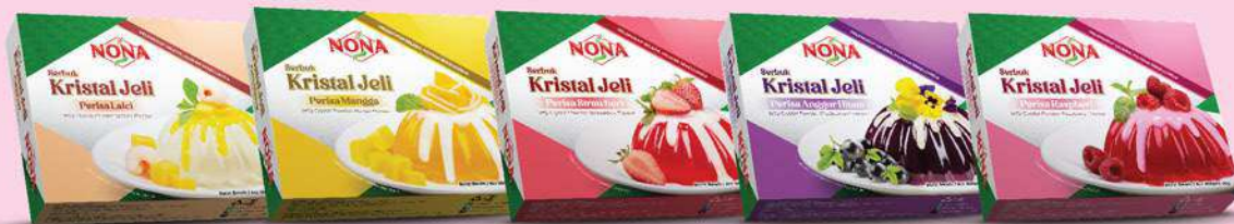
Serbuk Kristal Jeli Crystal Jelly Powder