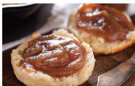
SCONES WITH COCONUT JAM