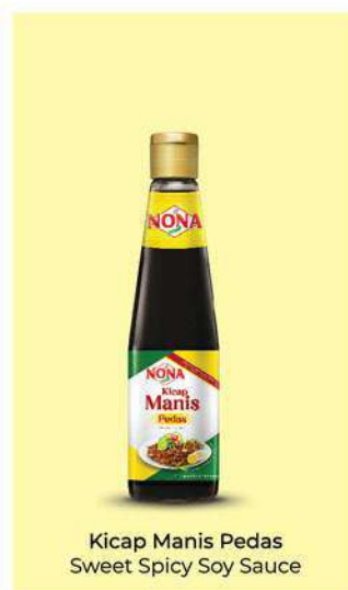
Kicap Manis Pedas Sweet Spicy Soy Sauce