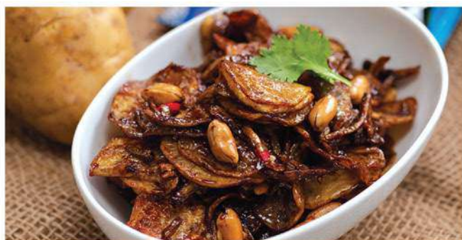
CRISPY ANCHOVIES WITH POTATO