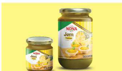
Jam Nenas Pineapple Jam