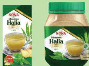
Minuman Halia Klasik Classic Ginger Drink