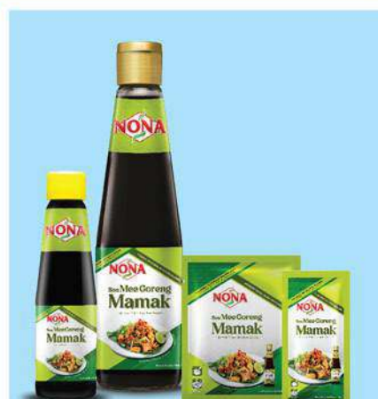
Sos Mee Goreng Mamak Fried Mamak Noodle Sauce