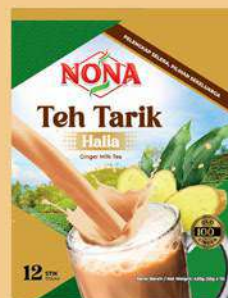
Teh Tarik Halia Ginger Milk Tea