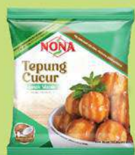
Tepung Cucur Lemak Manis Lemak Manis Fritter Flour