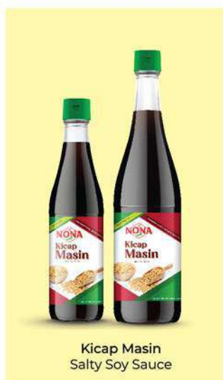
Kicap Masin Salty Soy Sauce