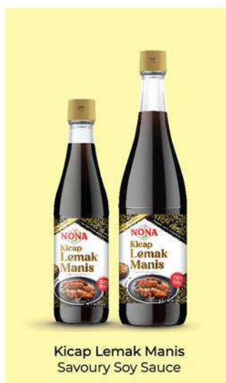
Kicap Lemak Manis Savoury Soy Sauce