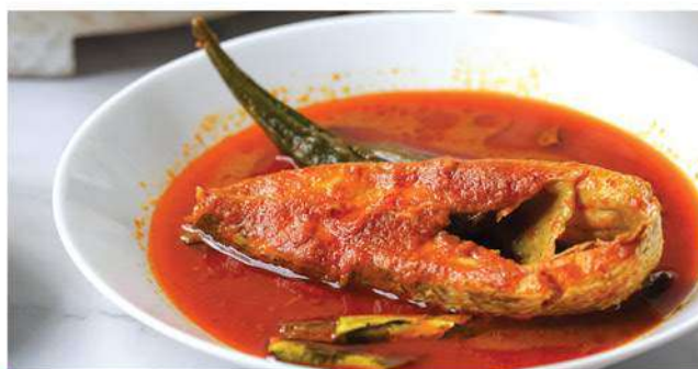
SPICY TAMARIND FISH