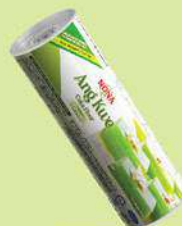
Tepung Pelita Ang Kwe Hijau Green Ang Kwe Cake Flour