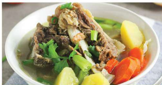
SPICED OXTAIL SOUP