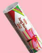
Tepung Pelita Ang Kwe Merah Red Ang Kwe Cake Flour