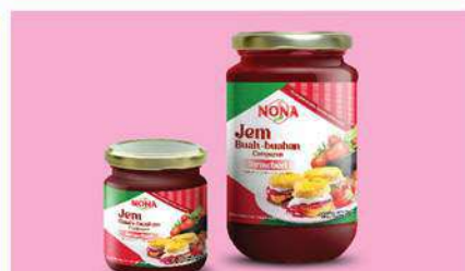
Jam Strawberry Strawberry Jam