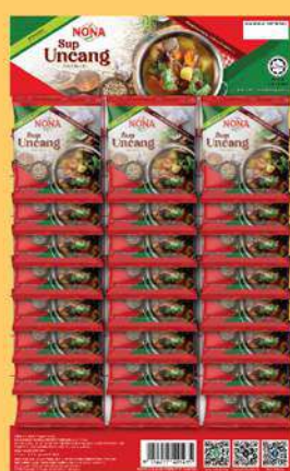
8g Pack with Display Board 8g x 24 x 25