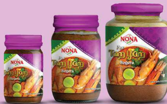
Pes Tom Yam Segera Instant Tom Yam Paste