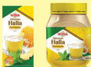
Minuman Halia Bermadu Honey Ginger Drink