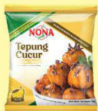
Tepung Cucur Pisang Banana Fritter Flour