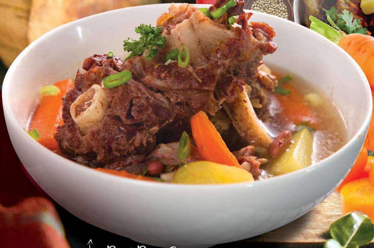
Beef Bone Soup