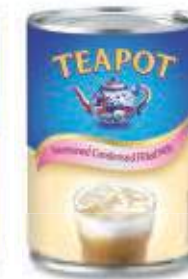
Filled Milk / حليب محشو