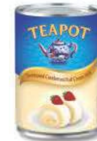
Full Cream Milk / حليب كامل الدسم

390gm X 48 / 48 X جرام 390 392gm X 48 / 48 X جرام 392 500gm X 48 / 48 X جرام 500