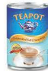
Full Cream Milk / حليب كامل الدسم

160g X 48 / 48 X جرام 160 390g X 48 / 48 X جرام 390