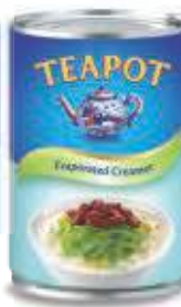
Creamer / مقشدة