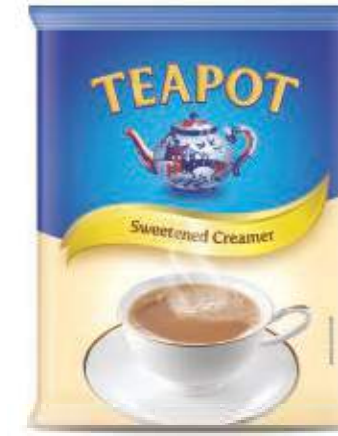
Creamer / مقشدة

388gm X 48 / 48 X جرام 388 390gm X 48 / 48 X جرام 390 500gm X 48 / 48 X جرام 500 1kg X 24 / 24 X كيلو غرام 1 2.5kg Pouch X 8 / 8 X كيلو غرام 2.5