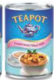
Filled Milk / حليب محشو