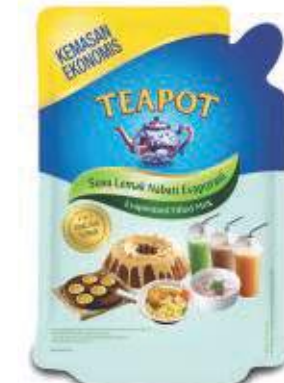
Creamer / مقشدة