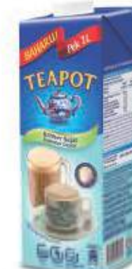
Creamer / مقشدة