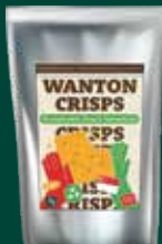
Wonton Crisps Snacks