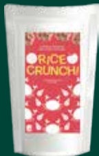
Rice Crunch Snacks

Ready meals in 5 minutes. LG crafts beloved classics, bringing you authentic Asian flavours.