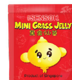
SENSOH MINI GRASS JELLY 190g(19g*10pcs)*24pkts