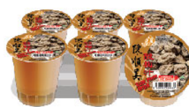
SOUR PLUM DRINK 185g*6cups*6trays