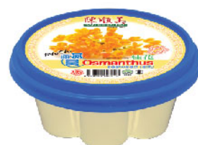
OSMANTHUS SEAWEED JELLY 250g*36bowls