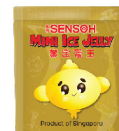
SENSOH MINI ICE JELLY 190g(19g*10pcs)*24pkts