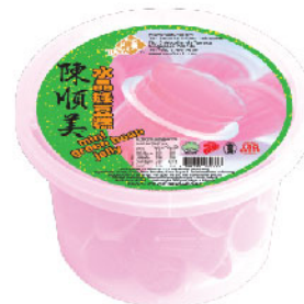
MINI GREEN BEAN JELLY 950g(19g*50pcs)*4tubs