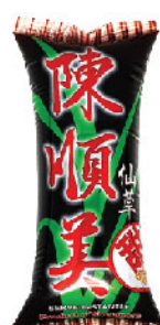
CHIN CHOW DESSERT 400g*20pcs