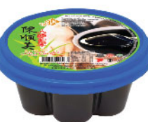
CHIN CHOW GINSENG 250g*36bowls