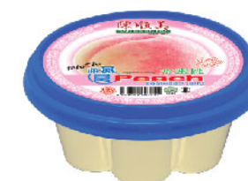
PEACH SEAWEED JELLY 250g*36bowls