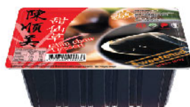
CHIN CHOW DESSERT 300g*30pcs