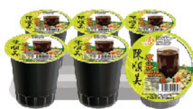
HERBAL TEA TEH SEHAT 185g*6cups*6trays