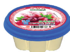
PASSION FRUIT SEAWEED JELLY 250g*36bowls