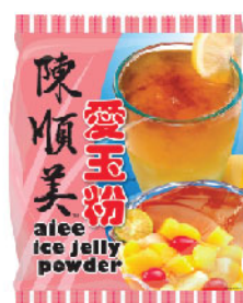
AIEE ICE JELLY POWDER 200g*10packs*5bags