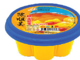
ICE JELLY 250g*36bowls