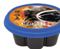
CHIN CHOW LINGZHI 250g*36bowls