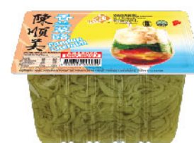
PENANG CHENDUL 450g*20pcs