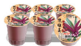
RU YI LAN DRINKS 185g*6cups*6trays