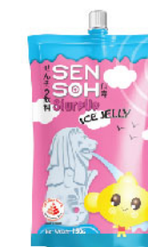
SENSOH SLURPUP ICE JELLY 150g*10pouch*4boxes