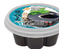
CHIN CHOW PEPPERMINT 250g*36bowls