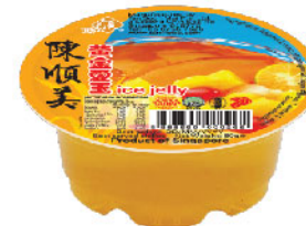
ICE JELLY 80g*80pcs