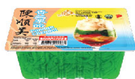
PANDAN CHENDOL 300g*30pcs/450g*20pcs