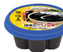
CHIN CHOW NATA DE COCO 250g*36bowls