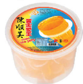
MINI ICE JELLY 950g(19g*50pcs)*4tubs