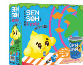
SENSOH SLURPUP GRASS JELLY 200g*6cups*5boxes