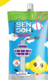
SENSOH SLURPUP GRASS JELLY 150g*10pouch*4boxes