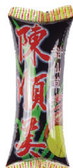
SWEETENED GRASS JELLY MANGO FLAVOUR 500g*20pcs