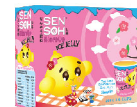
SENSOH SLURPUP ICE JELLY 200g*6cups*5boxes