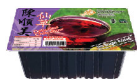
DELICIOUS CHIN CHOW NO SUGAR ADDED 290g*30pcs