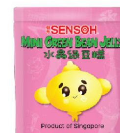
SENSOH MINI GREEN BEAN JELLY 190g(19g*10pcs)*24pkts