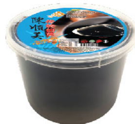
TRADITIONAL CHIN CHOW 2kg*4tubs