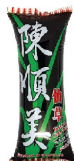
DELICIOUS CHIN CHOW NO SUGAR ADDED 500g*20pcs