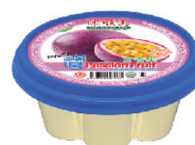
RED DATES LONGAN SEAWEED JELLY 250g*36bowls