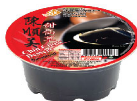
CHIN CHOW DESSERT 80g*80pcs