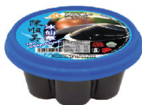
ICE CHIN CHOW 250g*36bowls