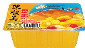
AIEE ICE JELLY 300g*30pcs