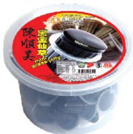
MINI GRASS JELLY 950g(19g*50pcs)*4tubs