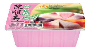
CHESTNUT GREEN BEAN CAKE 300g*30pcs