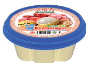
CRANBERRY SAKURA SEAWEED JELLY 250g*36bowls