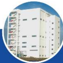
Ahmednagar (Maharashtra) 2016