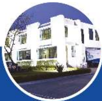
Sahibabad (Uttar Pradesh) 1987