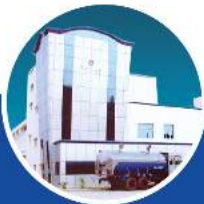
Gulaothi (Uttar Pradesh) 1992