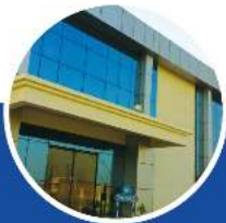
Sandila (Uttar Pradesh) 2007