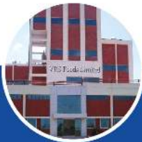
Malanpur (Madhya Pradesh) 2004

TOTAL MILK HANDLING CAPACITY AS MUCH AS 4.7 MILLION LITRES/DAY.