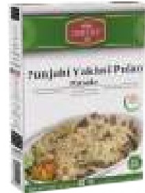
Punjabi Yakhni Pulao