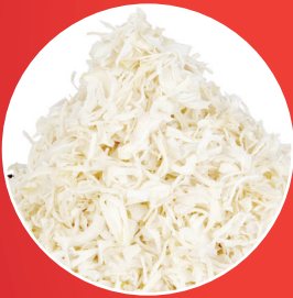
Dehy. white Onion Flakes