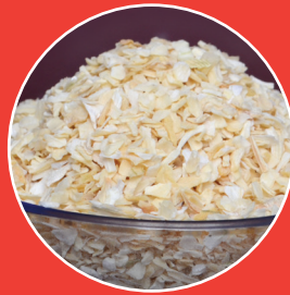
Dehy. White Onion Chopped