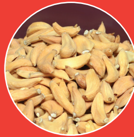
Dehy. Garlic Flakes