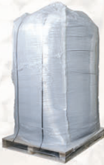
White Big Bag on Pallet