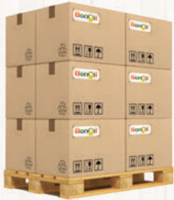
Carton Boxes / Pallet