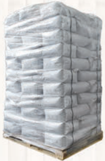
Bags on pallet