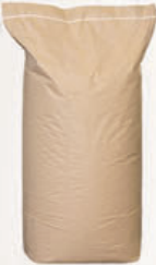
Brown Paper Bag