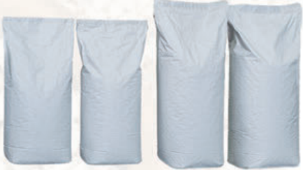
White Paper Bags