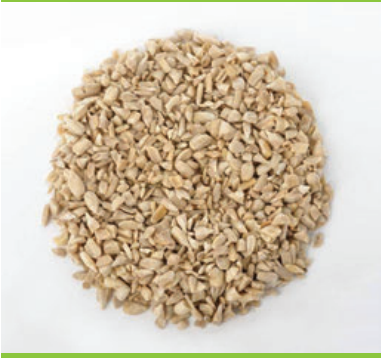
Medium chips 1500 pcs/oz