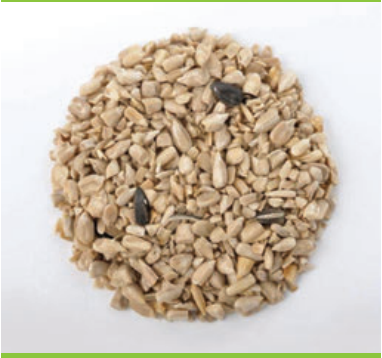
Bird food 650+-50 pcs/oz