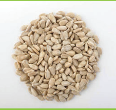
Bakery premium 600+-50 pcs/oz