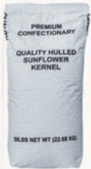
Branded paper bags