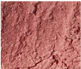
Turkey MDM 602