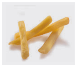
Standard fries 9 x 9