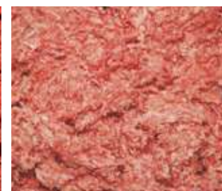
Turkey baader 604 (± 4mm)