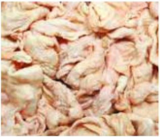
Chicken skin 607

Cooking to boost the taste or improve the binding of your product? Turkey or chicken skin is rich on proteins and collagene that helps to upgrade the binding of your product. An additional advantage is the amazing taste that skin brings along in your receipt. On top of this, when working with high valued raw materials this 100% natural product will drive your cost down.