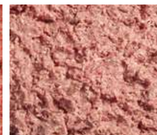
Chicken baader 605 (± 4mm)