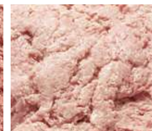
Chicken white meat 606 (± 5mm)