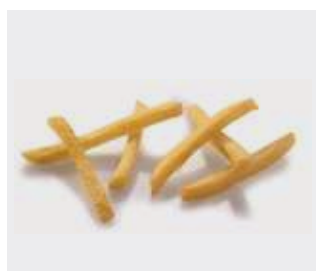
Standard fries 7 x 7