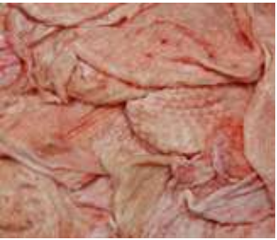
Turkey skin 608