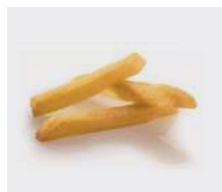
Standard fries 12 x 12