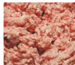
White chicken baader 609 (± 5mm)