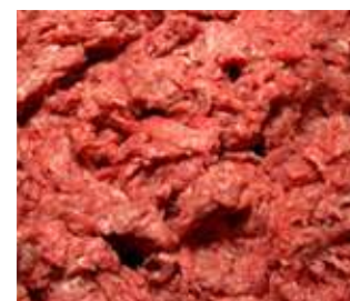
Turkey red meat 603 (± 3-5mm)

What about Damaco baader in your products? If you want to add more texture than this is the type of meat that you are looking for! A 4-5 mm structure will allow you to produce the bite you need. When talking about medium to big structure products types such as meatballs, hamburgers and medium fine sausages. Do not forget that you can combine Damaco MDM and Baader with each other to improve the quality of your product to the required level of your market. 35 years of experience in our industry gives you a choice in different types of Baader suitable to your end product.