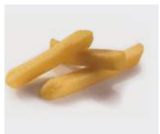
Standard fries 14 x 14