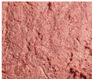
Chicken MDM 601

Our Soft-Method production process guarantees the protein level and structure that is important for the binding and water observation of your end product. Our MDM can be used as sole basic ingredient or to mix up with other types of Damaco products, such as baader meat. Call us for additional advice, we are ready to serve you!