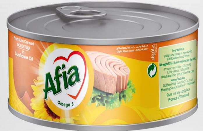
Solid in Sunflower Oil 160g