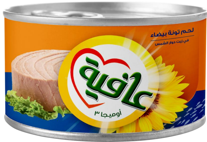
Solid in Sunflower Oil 160g