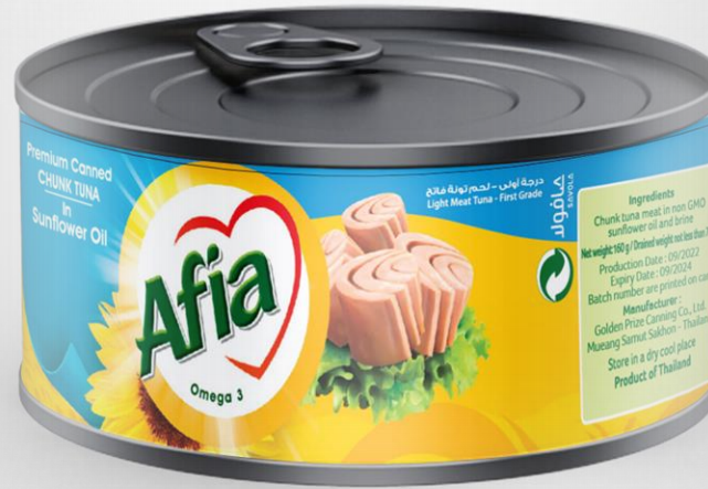
Chunks in Sunflower Oil 160g