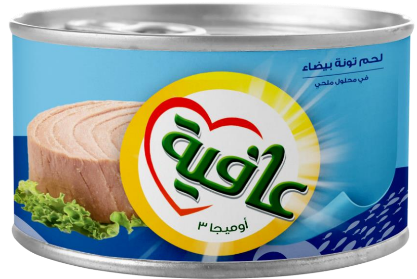
Solid in Brine 160g