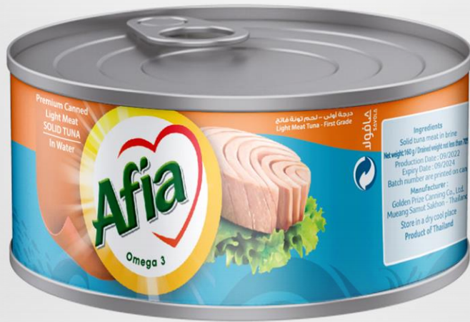
Solid in Brine 160g