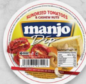
Sundried tomatoes & Cashew Nuts Label