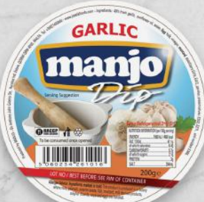
Garlic Dip Label