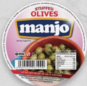
Stuffed Olives Label

JOSEFA's organisation dedicates a significant share of its activities to private label partnerships, providing a complete service to its clients: starting from the graphic and packaging design, to the recipe-making, the laboratory analysis, raw materials provision, culinary tests, production, assembly, storage, and logistics with planned delivery.