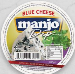
Blue Cheese Label