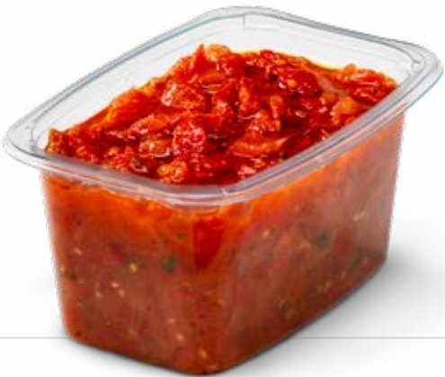
CHOPPED MIX BABY PLUM TOMATOES