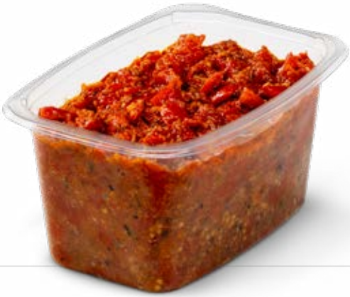
CHOPPED MIX BABY PLUM TOMATOES, OLIVES AND CAPERS