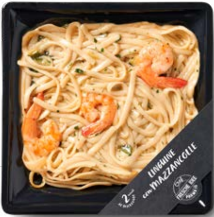
LINGUINE WITH PRAWNS