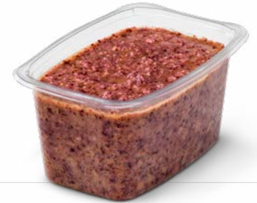
RADICCHIO PESTO, CHEESE AND ALMONDS