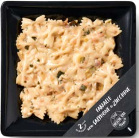
FARFALLE WITH SALMON AND COURGETTES