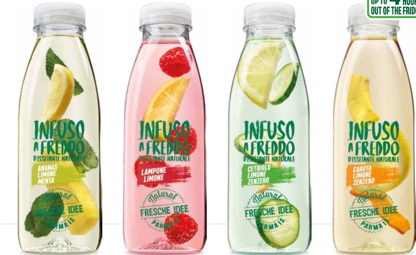
COLD-INFUSED PINEAPPLE, LEMON AND MINT