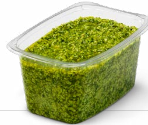
PESTO GENOVESE, BASIL PESTO WITH CHEESE AND DRIED FRUIT