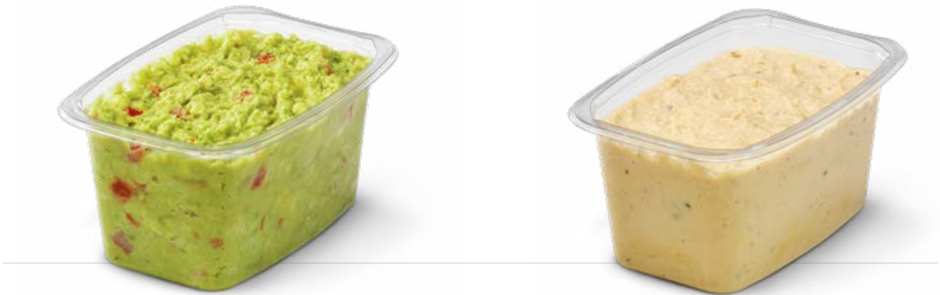
AVOCADO GUACAMOLE DIP SAUCE