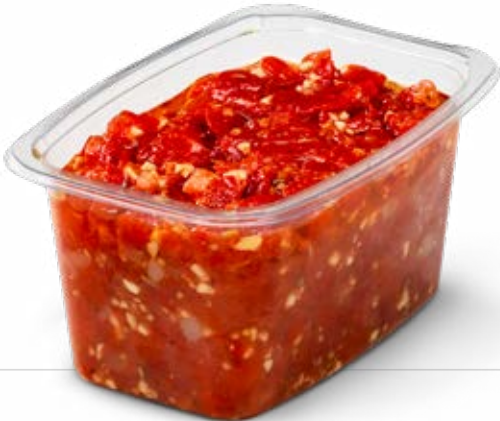
CHOPPED MIX BABY PLUM TOMATOES AND GINGER