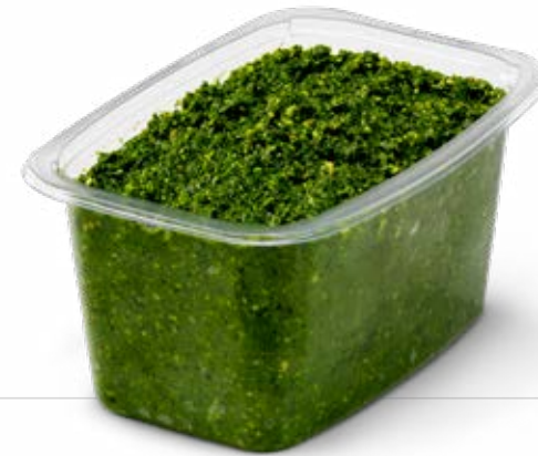
BLACK CABBAGE PESTO AND DRIED FRUIT