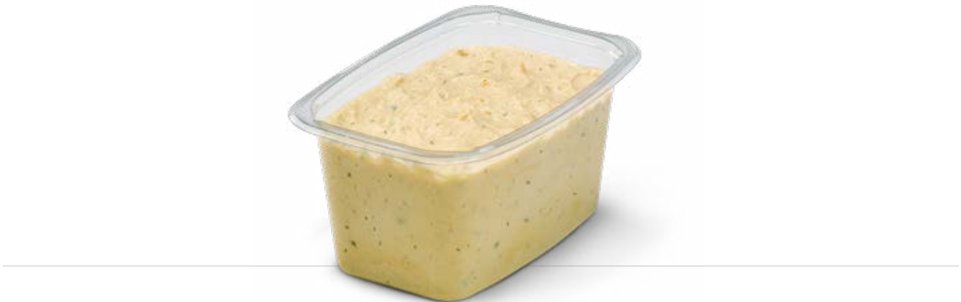
CHICKPEAS HUMMUS WITH HERBS DIP SAUCE