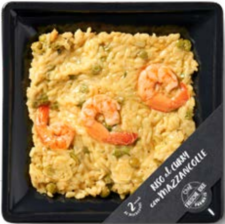
CURRY RICE WITH PRAWNS