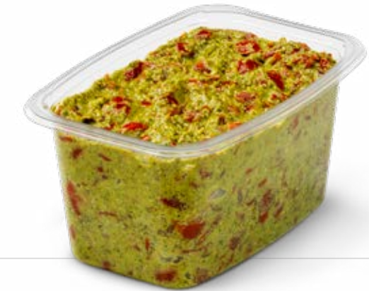
BASIL PESTO WITH BABY PLUM TOMATOES AND DRIED FRUIT