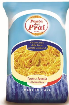
Durum Wheat Semolina Pasta