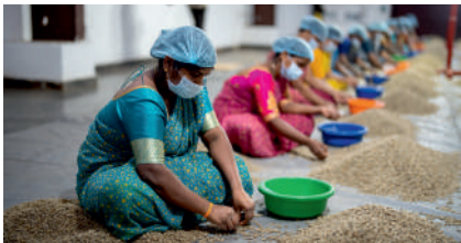
Hand Garbeled Special Prepared Coffee With Less Defects Count

MONSOONED MALABAR AA ROBUSTA AA ROBUSTA KAAPi ROYALE - 18 ROBUSTA CHERRY PB (WET POLISHED) ROBUSTA CHERRY AA (WET POLISHED) SINGLE ESTATE COFFEE WITH TRACEABILITY