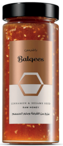
CINNAMON & SESAME SEED

We match top-quality whole spices, herbal essences, and ingredients to complement the rich, moreish flavor of Balqees Sidr or Sumar honey. These delicious infusions combine the nutrient-rich base honey with the stimulating or therapeutic properties of the added elements for even greater benefit. These range from our Herbal honey fusion - a potent mix of Royal Jelly, Bee Pollen, Ginseng, and Ginger - to Madagascan Vanilla Bean and Cinnamon. Explore our full range online or in-store. We work with nature to harvest a range of pure bee products which are immensely potent in health-giving properties