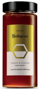
LEMON & GINGER