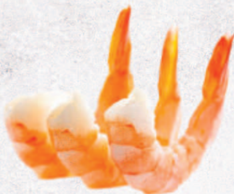
Cooked PD Tail-On Shrimp