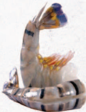
Raw Easy Peel Shrimp