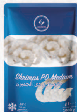
Shrimps PD Medium