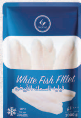
White Fish Fillet