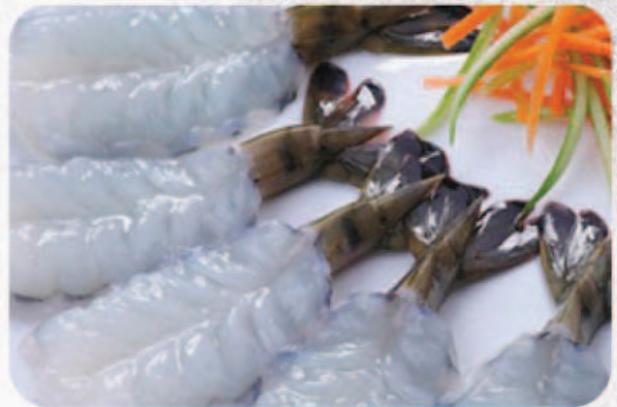
Raw Butterfly Shrimp