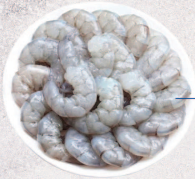
Peeled Deveined Shrimp