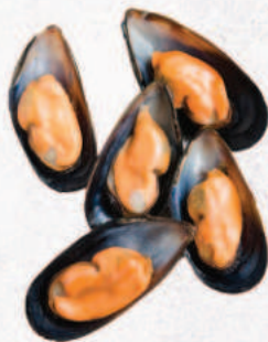
Half Shell Mussels