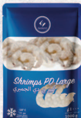
Shrimps PD Large