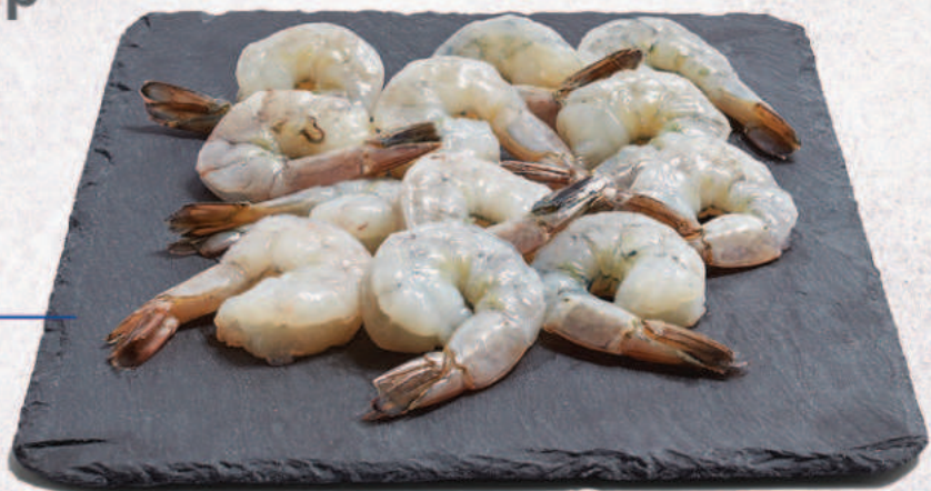
Peeled Deveined Tail-On Shrimp

8/12 | 13/15 | 16/20 | 21/25 | 26/30 | 31/40 | 41/50