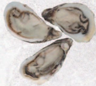
Oyster with Shell