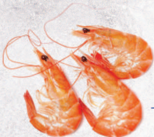
Cooked Head-On Shell-On Vannamei Shrimp