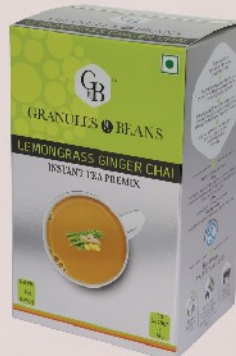
Lemon Grass Ginger