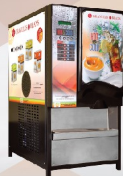
Hot & Cold