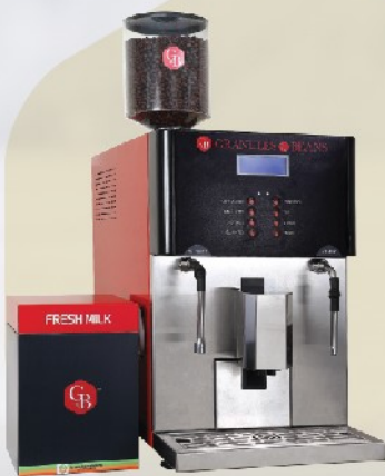
Beans to Cup