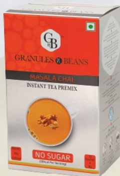
Masala Chai No sugar