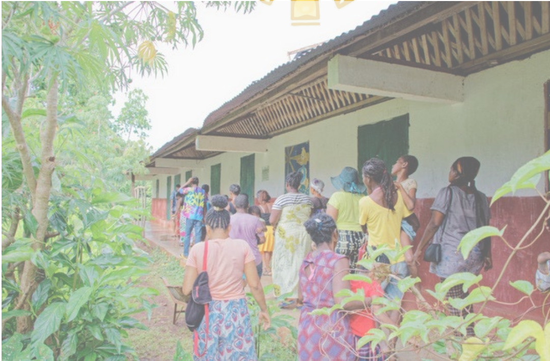
Parents and their children are inspecting the new facilities