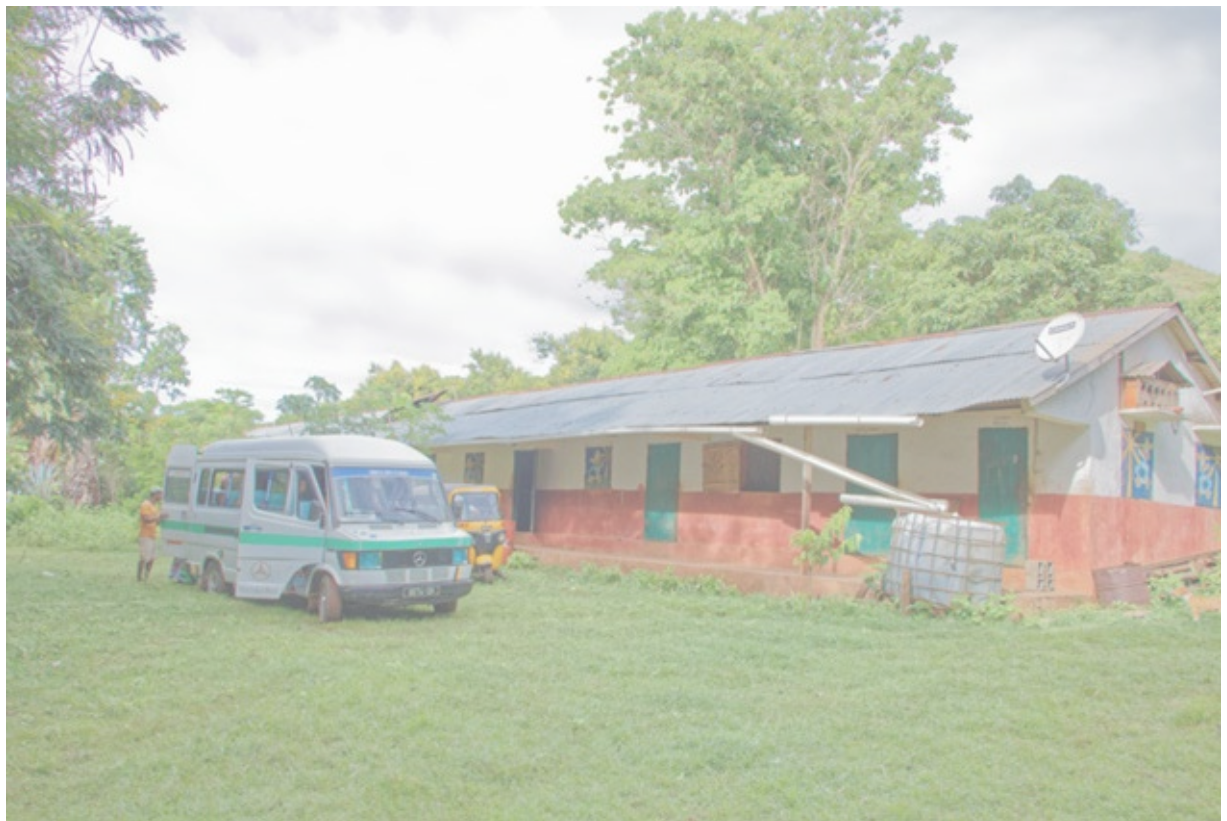
Rented facility and our school bus