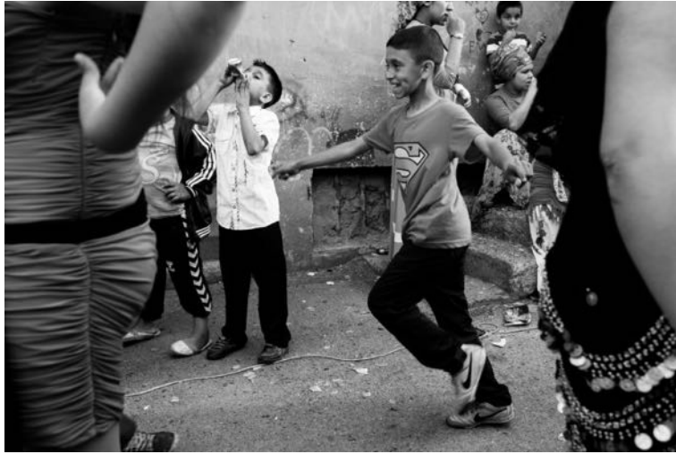
Rollei Superpan (BW)

At a time when camera technology's advancing at a clip, there seems to be an equal push in the opposite direction to bring back aesthetics that have taken a backseat. Film is alive and well, though there are fewer options today than there were during much of the 20th century. While the actual film stock may be gone, there is software from the likes of VSCO, RNI, and in this review's case, Totally Rad, to imbue your digital images with older looks. We took a look at RNI's All Films 3.0 earlier this year, but today, we're taking a look at Replichrome III: Archive, a suite of presets solely focused on very old, long since discontinued film stocks. All told, there are 22 films and 183 presets.