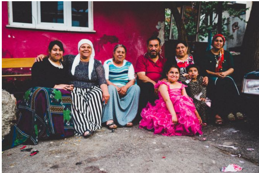
Agfa HDC 200 (Frontier) +