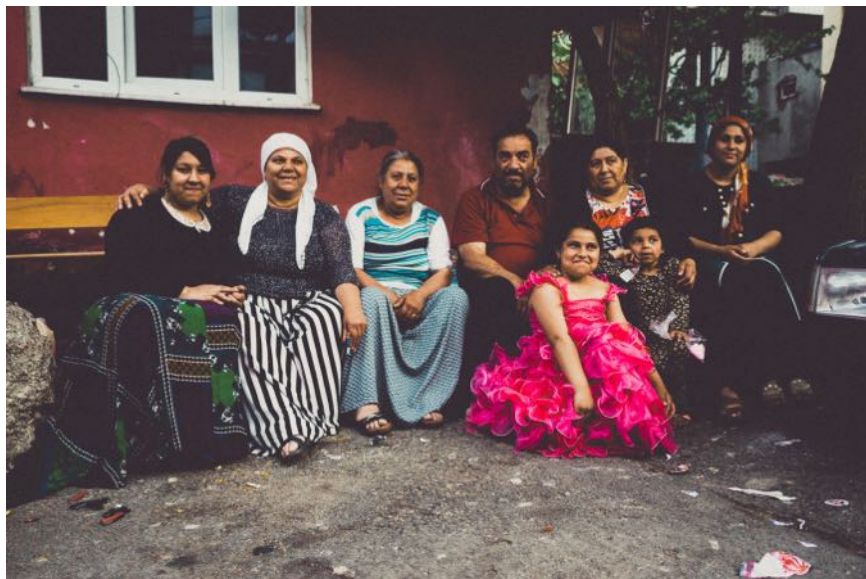
Agfa HDC 200 (Frontier) -

It's a simple click between presets, though you may get a bit lost if you keep clicking. Each of the packs (Agfa, Black and White, Kodak, Others, Tweak Kit) offers a "Reset Replichrome Film" option at the top of each dropdown menu to go back to the original image.