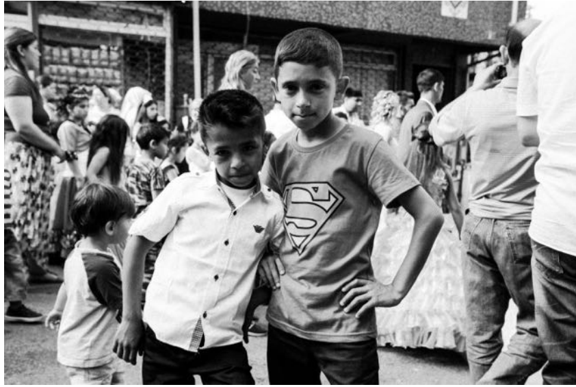
Ilford SFX 200