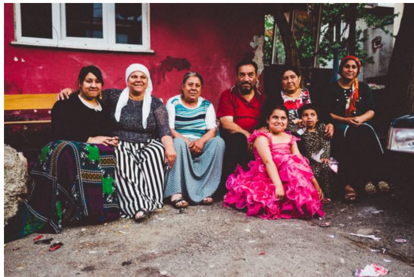
Agfa HDC 200 (Frontier)

The presets show up in the left window, and each base preset has a slightly overexposed and slightly underexposed option, as denoted by the – and + next to each name. Here are three examples: