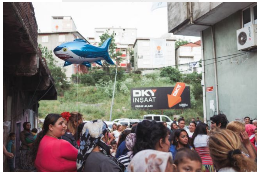
Konica Optima 100 (Frontier)