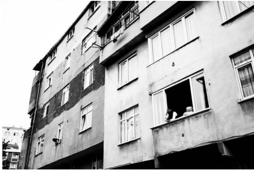
Patterson Acupan 200