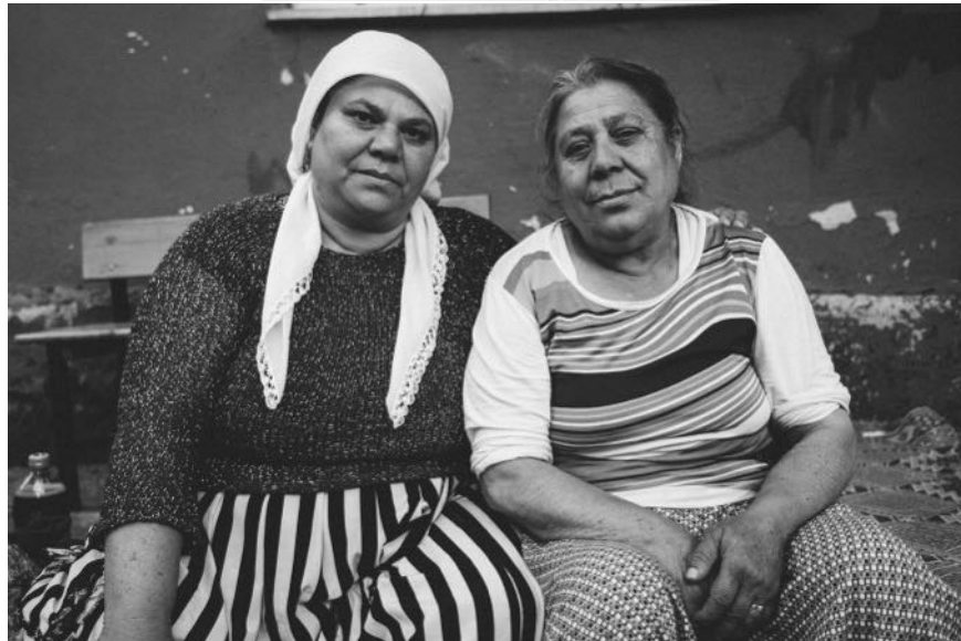
Ilford XP2 Super