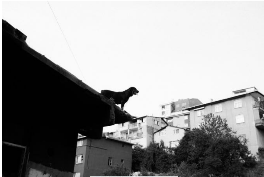
Agfa APX 400