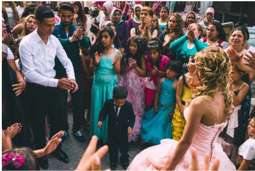
Kodak PJ800 (Frontier)