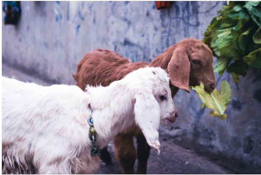
Orwo Color (Frontier)