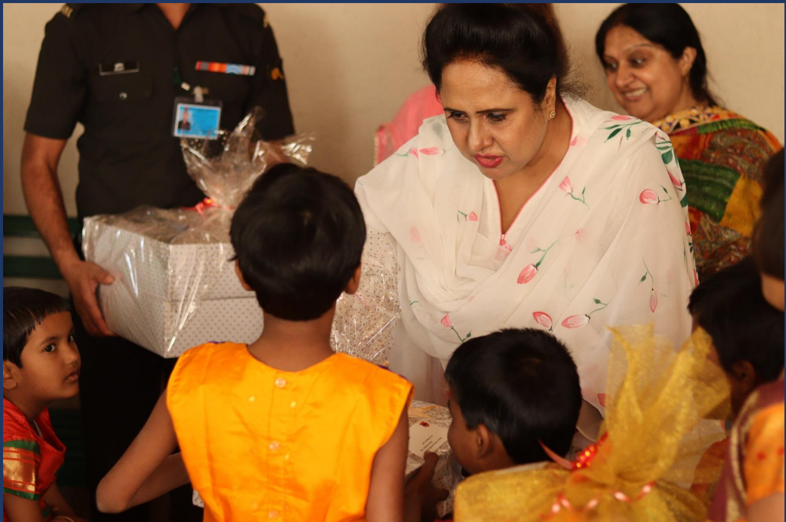
Regional President and Functionaries of the Army Wives Welfare Association (January 2023)