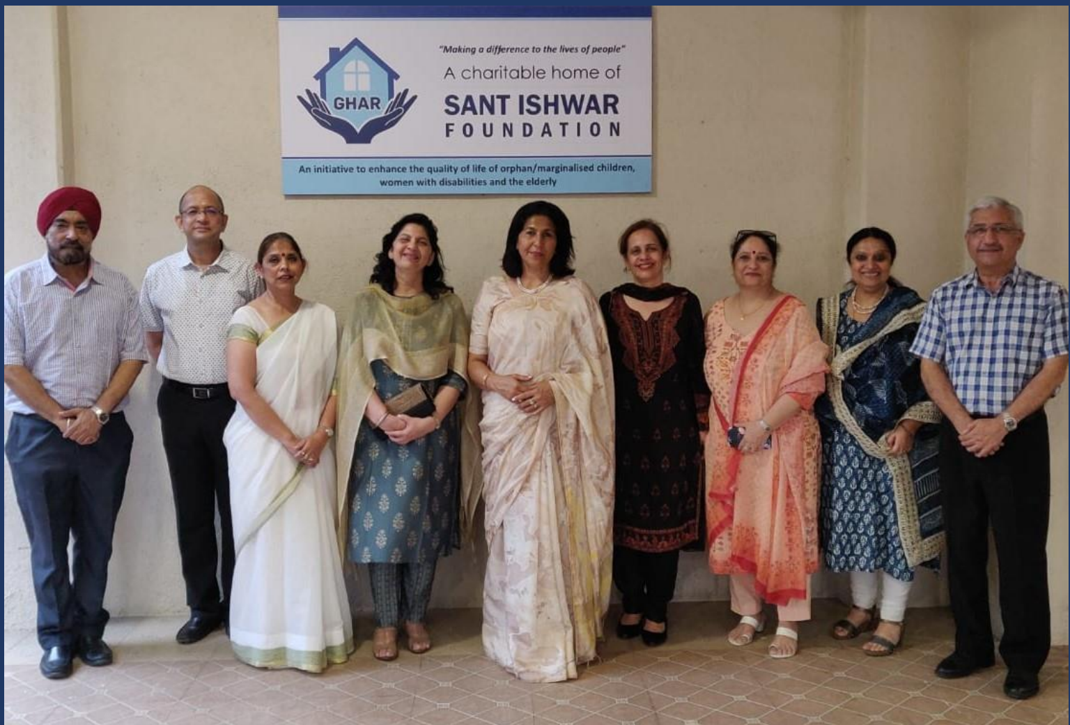
Regional President and Functionaries of the Army Wives Welfare Association (August 2022)