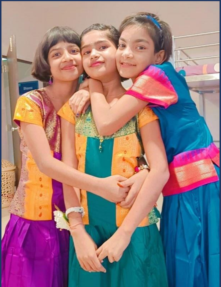
Celebrating the Festival of Lights