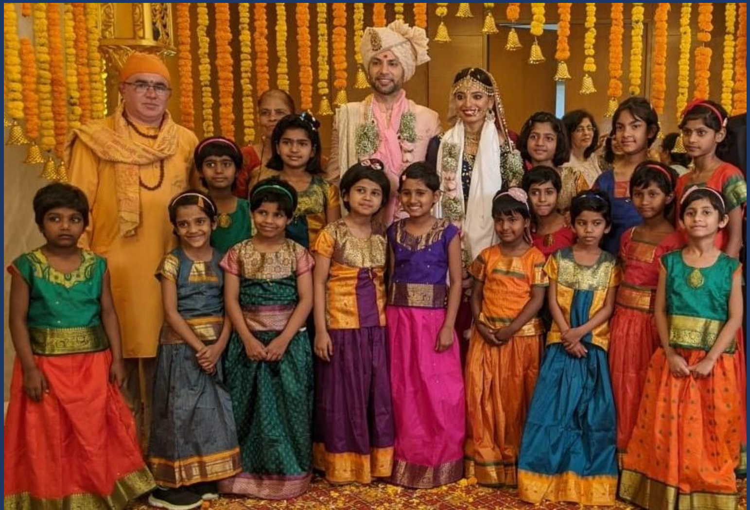
Wedding Bells of their Teacher