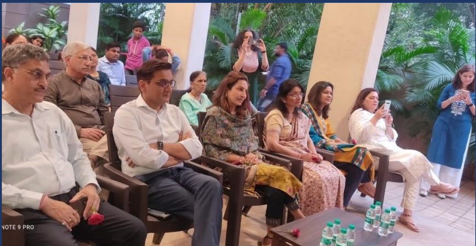
Our well wishers