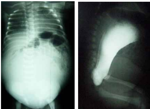
Figure 114.1: Abdominal radiograph showing a mass density in a 3-day-old infant (left); abdominal radiograph on lateral view showing a hydrometrocolpos in a 3-day-old infant (right).

Early diagnosis and treatment of hydrocolpos or hydrometrocolpos is important to minimise various complications of mechanical pressure exerted on surrounding structures. The most important step is a comprehensive perineal examination. Cross-sectional imaging and dye studies help in early diagnosis and demarcating the exact anatomy as well as revealing associated renal anomalies. 1 Comprehensive management is necessary, usually involving surgical treatment, to provide normal phenotypic appearance and to preserve reproductive potential.