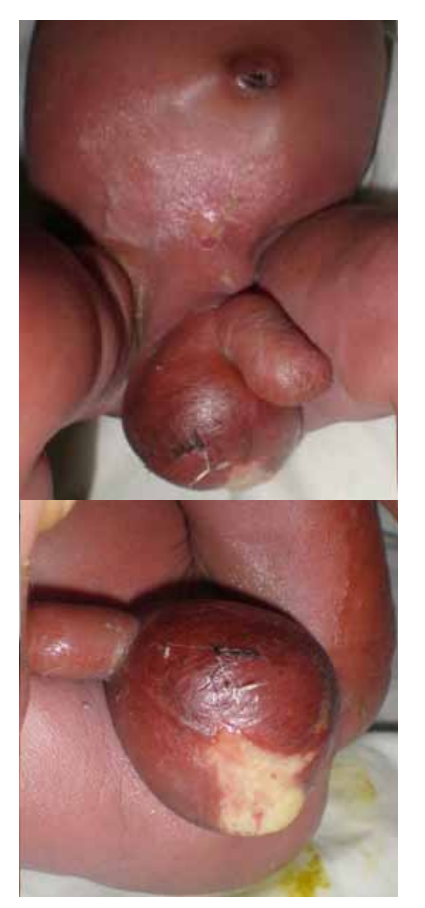
Figure 20.2: Periumbilical cellulitis with early necrosis of scrotal skin.

Necrotising fasciitis is one of the most commonly reported serious complications of omphalitis,<sup>1,8-12</sup> occurring in 26% of patients with major complications, according to one report.<sup>6</sup> It has been noted to occur in 13.5% of neonates with omphalitis.<sup>8</sup> The condition starts initially as periumbilical cellulitis, which, without treatment, progresses rapidly to necrosis of the skin and subcutaneous tissue (Figures 20.2 and 20.3), and in some instances,