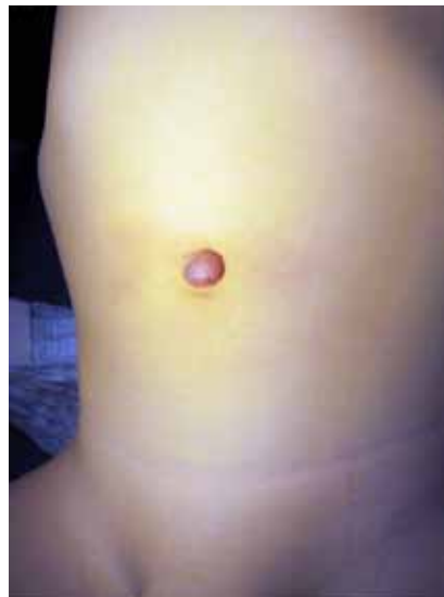
Figure 57.3: Umbilical polyp.

In children, umbilical hernias often close spontaneously. Small defects (<1 cm) are much more likely to close than large defects (>2 cm). Meier et al. reported that umbilical hernias continue to close until the age of 14 years in African children. 16 The skin overlying an