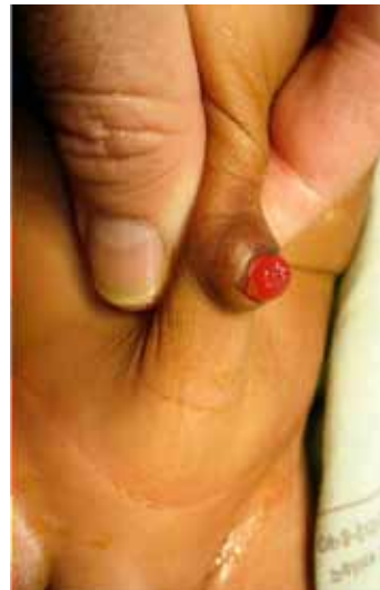
Figure 57.1: Omphalomesenteric fistula.