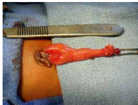
Figure 57.2: Omphalomesenteric fistula (intraoperative).