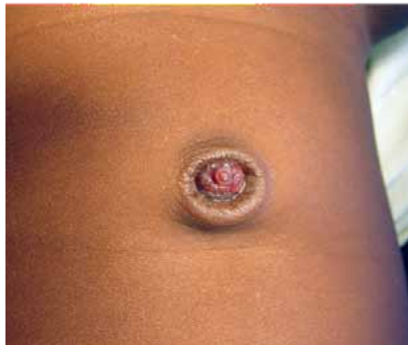
Figure 57.4: Urachal remnant.