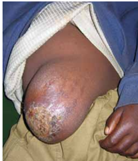
Figure 57.6: Giant ulcerated umbilical hernia.

Factors that lead parents to seek medical care for their child in Africa include the age of the child, size of the defect, height of protruding