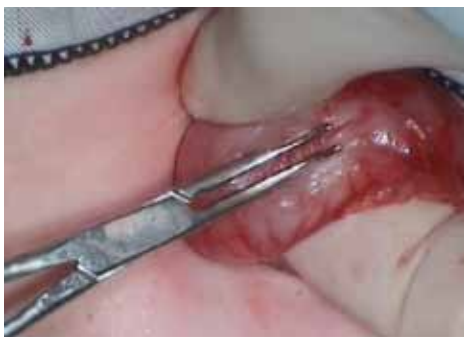
Figure 59.4: Spreading of the divided pyloric muscle.