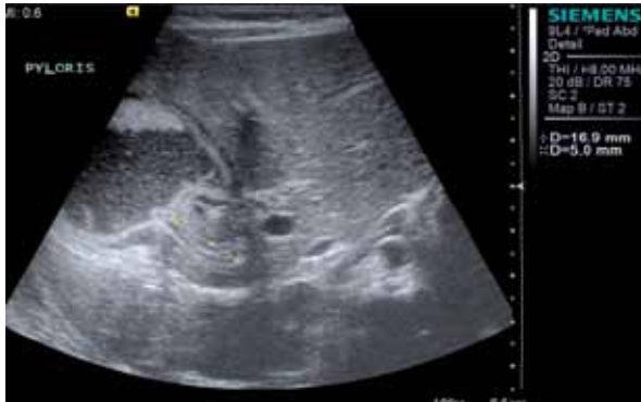
Figure 59.1: Ultrasound features of pyloric stenosis.

In an occasional case where doubt still persists after US examination, an upper gastrointestinal (UGI) series may be done. The UGI series would show a narrow pyloric channel, the so-called “string sign” and the “shoulder sign”, caused by the impression of the pylorus into the stomach (Figure 59.2).