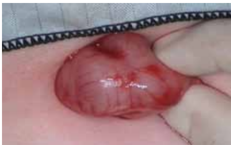
Figure 59.3: Operative view of pyloric mass.

Use of a laparoscopic approach is increasing, with evidence supporting its benefits emerging. 18,19 A recent study has shown a safe alternative with a decreased time to full feeds postoperatively. 20