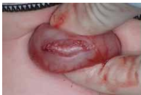
Figure 59.5: Myotomy with mucosal bulge.